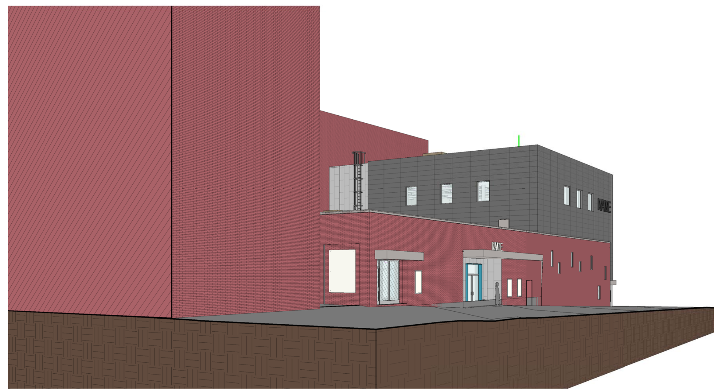
G1 EAST PERSPECTIVE