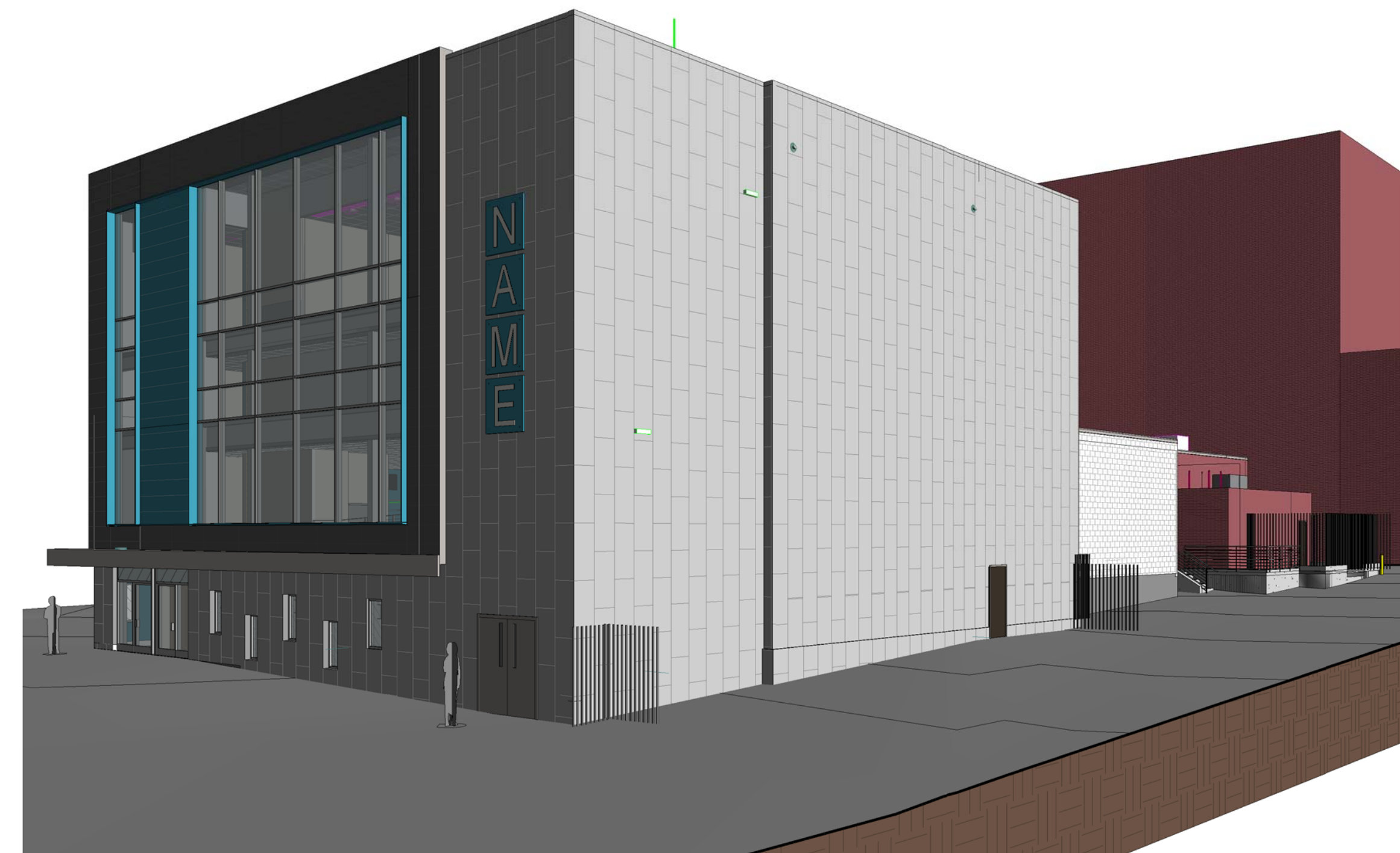
A9 WEST PERSPECTIVE