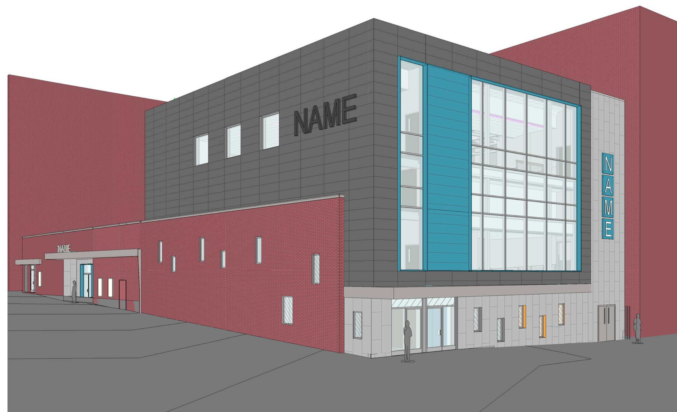
A1 SOUTH PERSPECTIVE