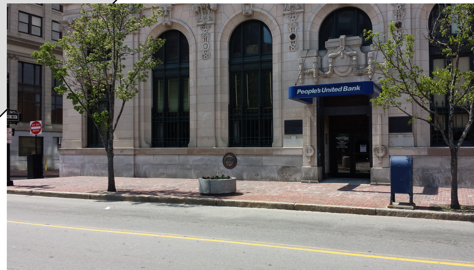
MAIN ENTRANCE AS VIEWED FROM MONUMENT SQUARE