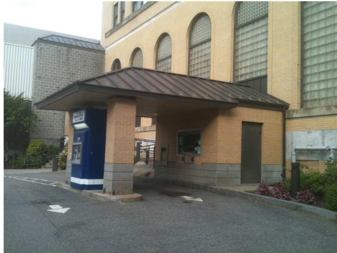
PEOPLE'S UNITED BANK 465-467 CONGRESS STREET