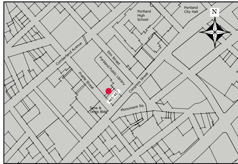
HISTORIC LANDMARK A.K.A. FIDELITY TRUST BLDG.