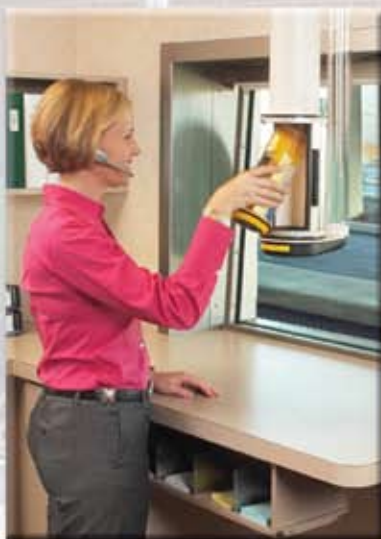
HA-1000 Upsend with Standard Teller Terminal