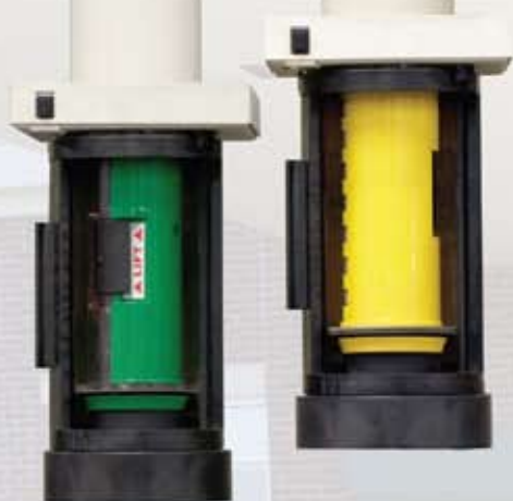
Standard Overhead Teller Terminals