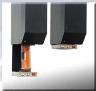
Motorized Teller Unit