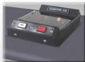
Thru-The-Counter Teller Unit