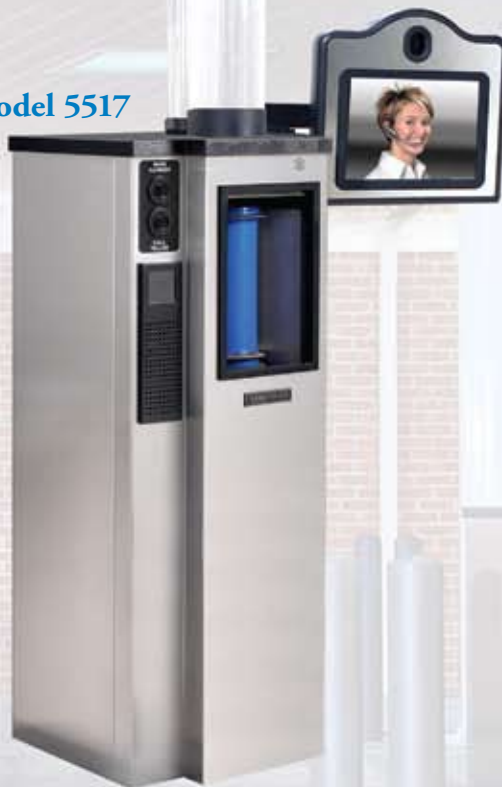
HA-1000 with Model 5517 Customer Video