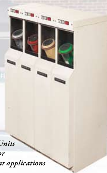
Narrow Downsends Units are available for 4" or 4.5" tube replacement applications