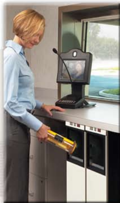
HA-1000D Downsends provides unrestricted visibility

Whether new construction or remodeling, HA-1000 systems provide the ultimate in versatility and accommodation for tellers and customer-service representatives. Styling blends with any architectural environment. Operation is simple, straightforward and reliable.