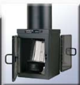
Double-Sided Upsend Teller Units