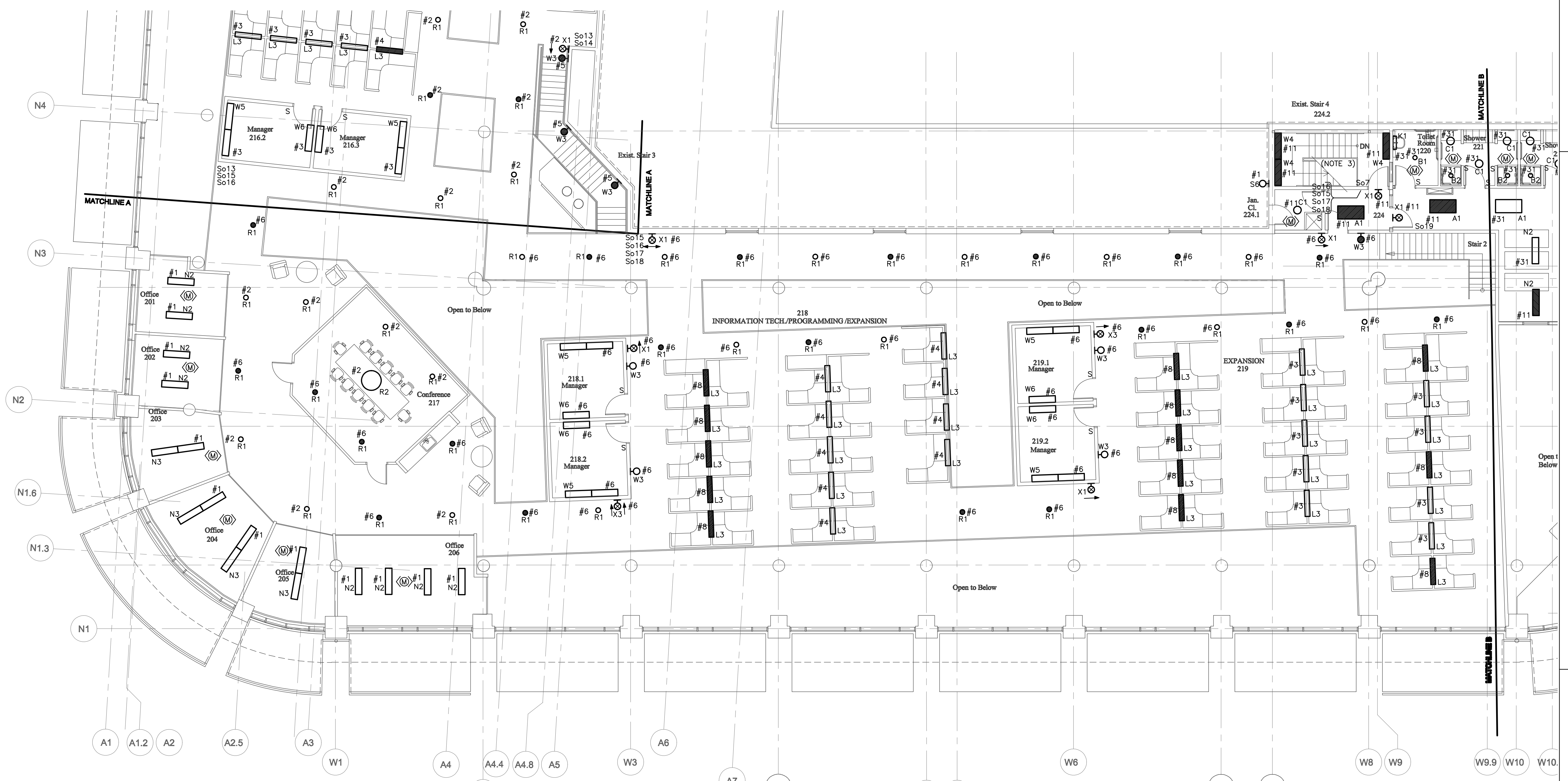
1 SECOND FLOOR LIGHTING PLAN - PART B E2.5 1/8" = 1'-0"