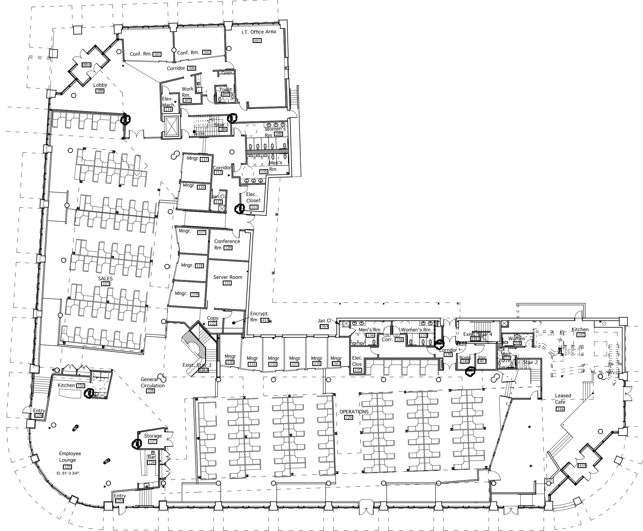
FIRST FLOOR FIRE EXTINGUISHER PLAN