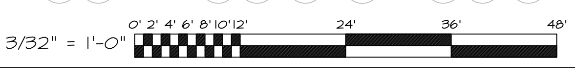
1 FIRST FLOOR HEATING PIPING PLAN NO SCALE

March 25, 2009 - 7:43 am \\Maine\Projects\0837 Power Pay\Drawings\0837 M11-M2.dwg