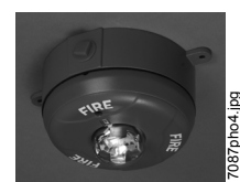
Outdoor Ceiling Strobe