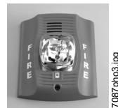
Indoor Wall Horn/Strobe