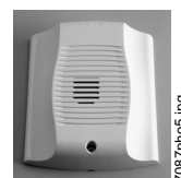
Indoor Wall Horn