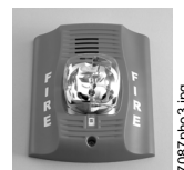
Indoor Wall Horn/Strobe