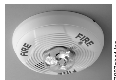
Indoor Ceiling Horn/Strobe