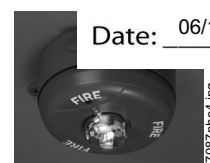
Outdoor Ceiling Strobe