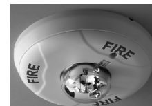
Indoor Ceiling Strobe