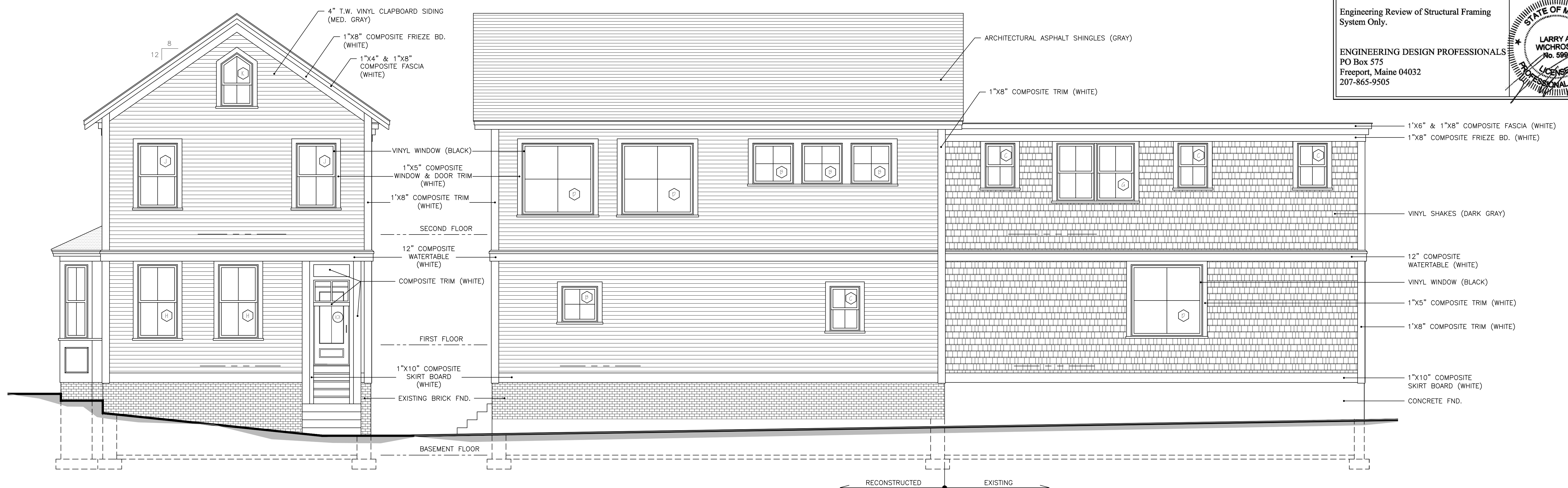
WILMOT STREET ELEVATION (EXISTING)

Engineering Review of Structural Framing System Only. ENGINEERING DESIGN PROFESSIONALS PO Box 575 Freeport, Maine 04032 207-865-9505 STATE OF MAINE LARRY A. WICHROSKI No. 5990 LICENSED PROFESSIONAL ENGINEER