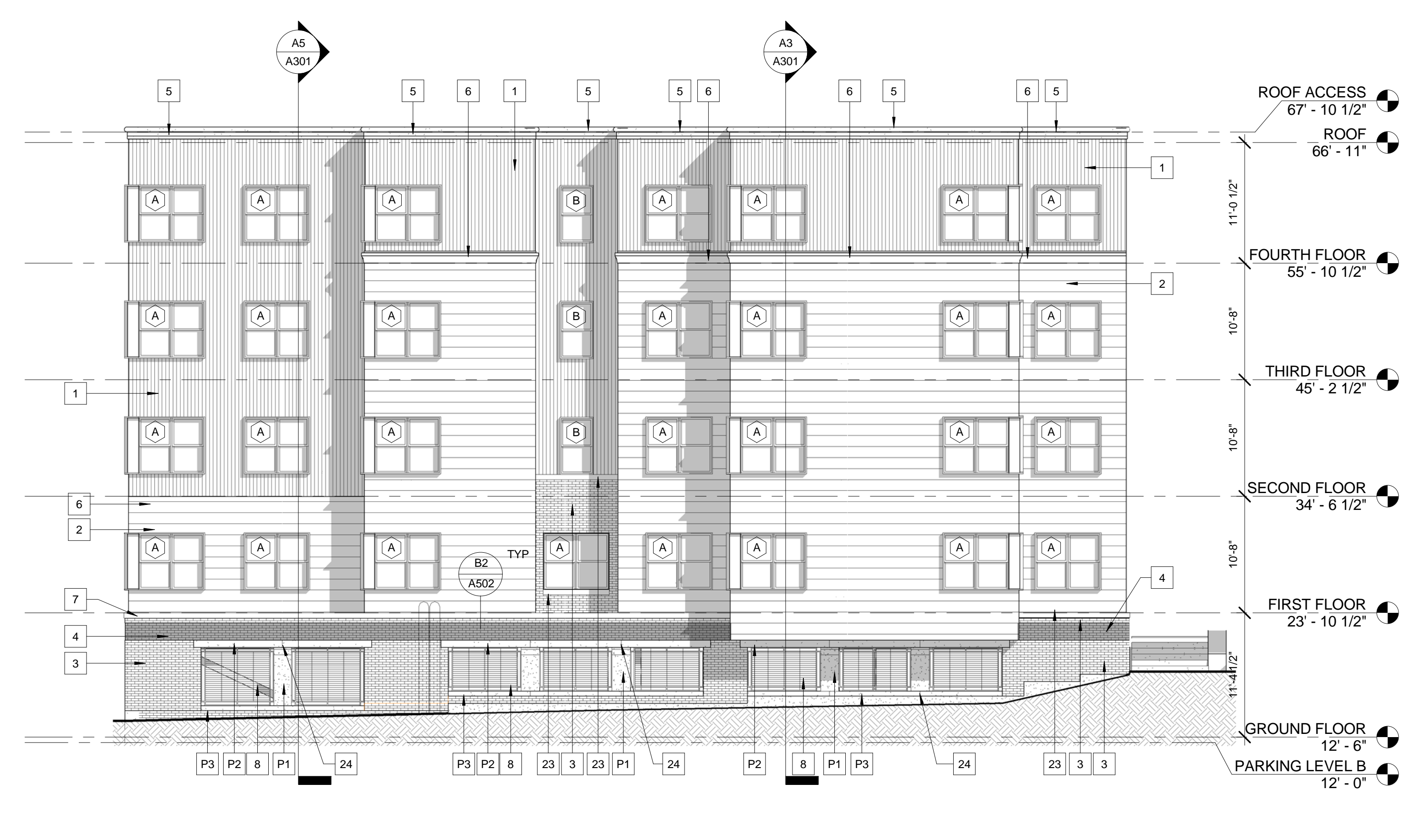
A4 EXTERIOR ELEVATION EAST - B WING 1/8" = 1'-0"