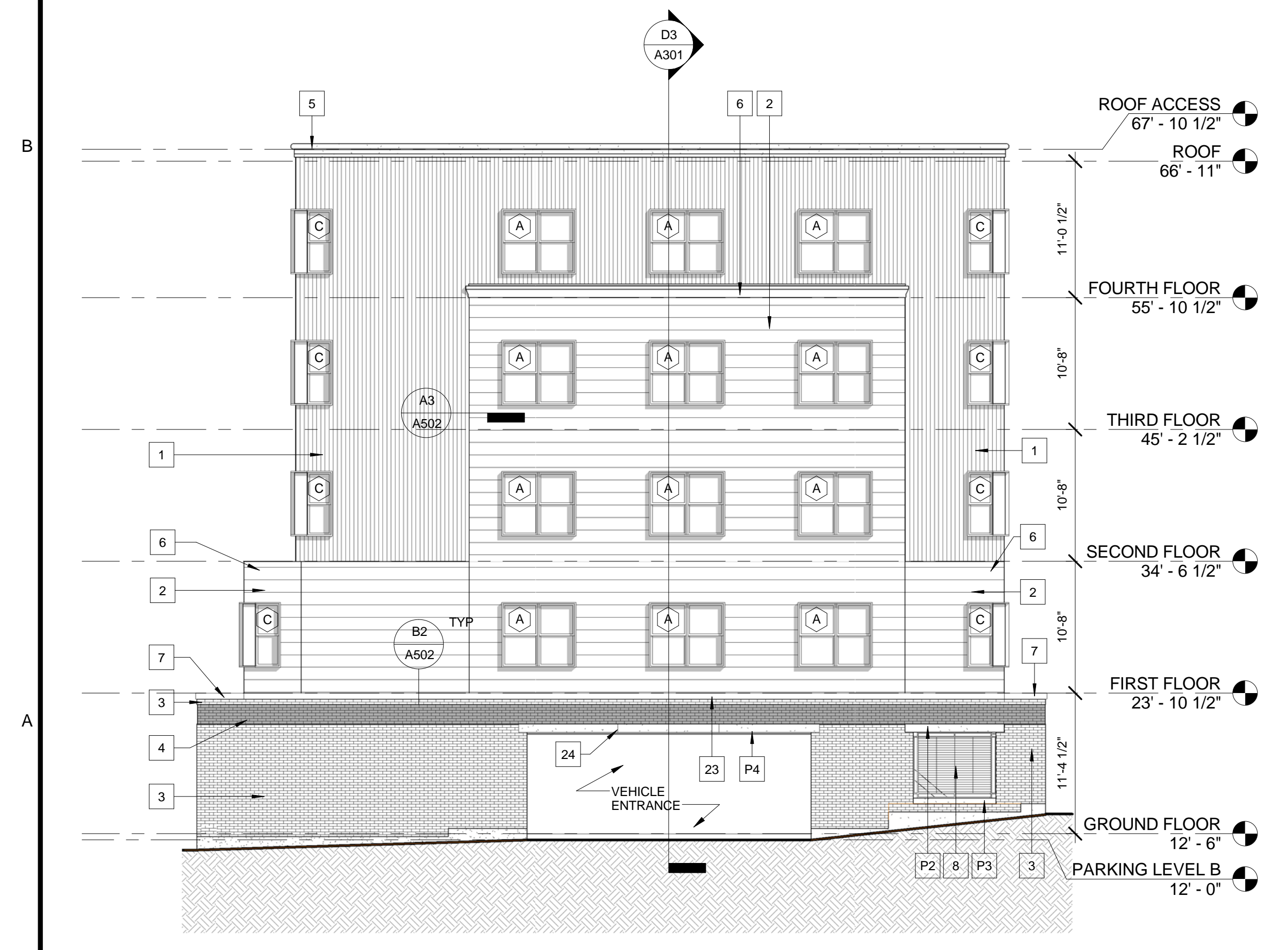
A6 EXTERIOR ELEVATION SOUTH B 1/8" = 1'-0"