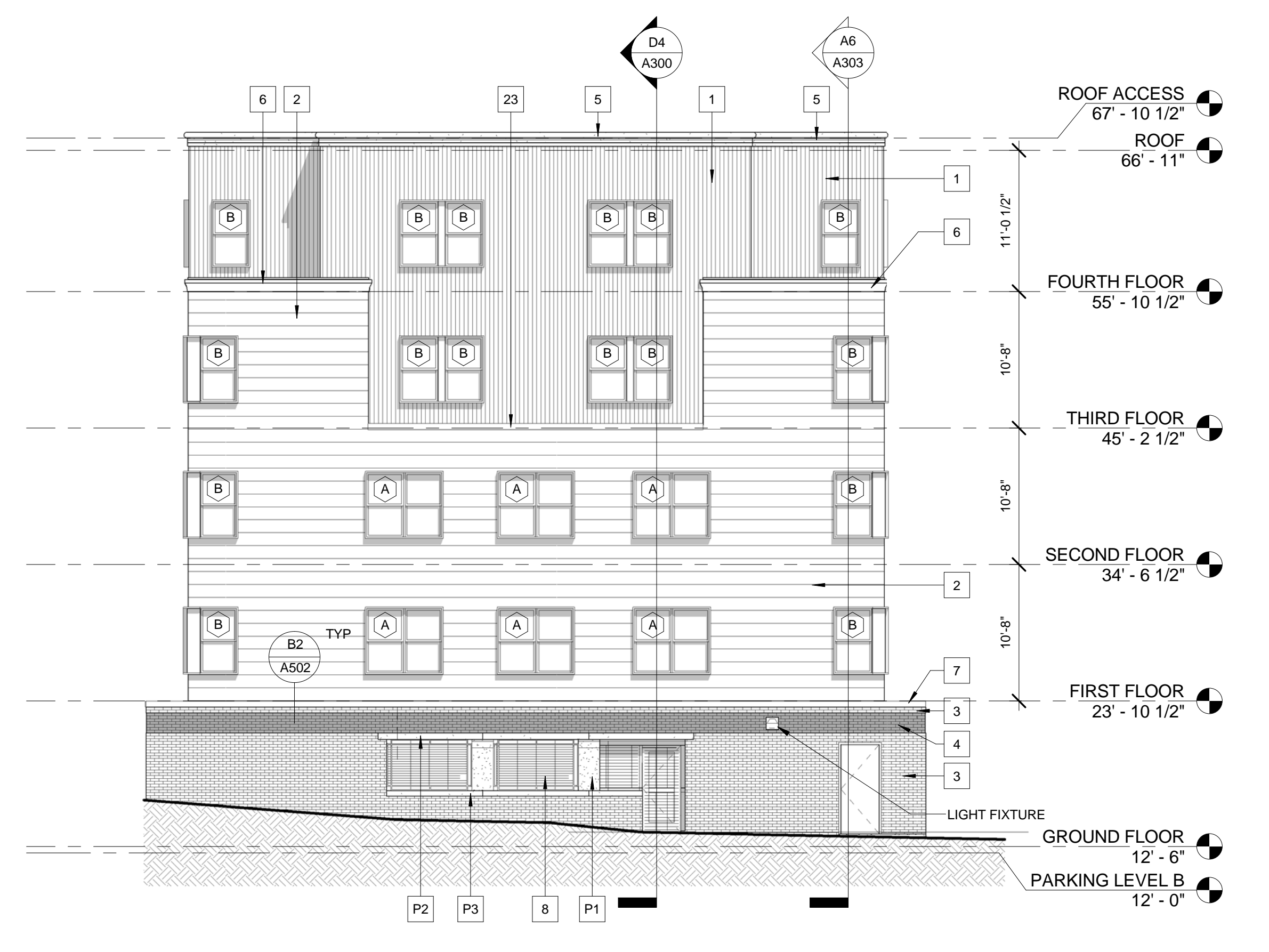
D2 EXTERIOR ELEVATION EAST - A WING 1/8" = 1'-0"