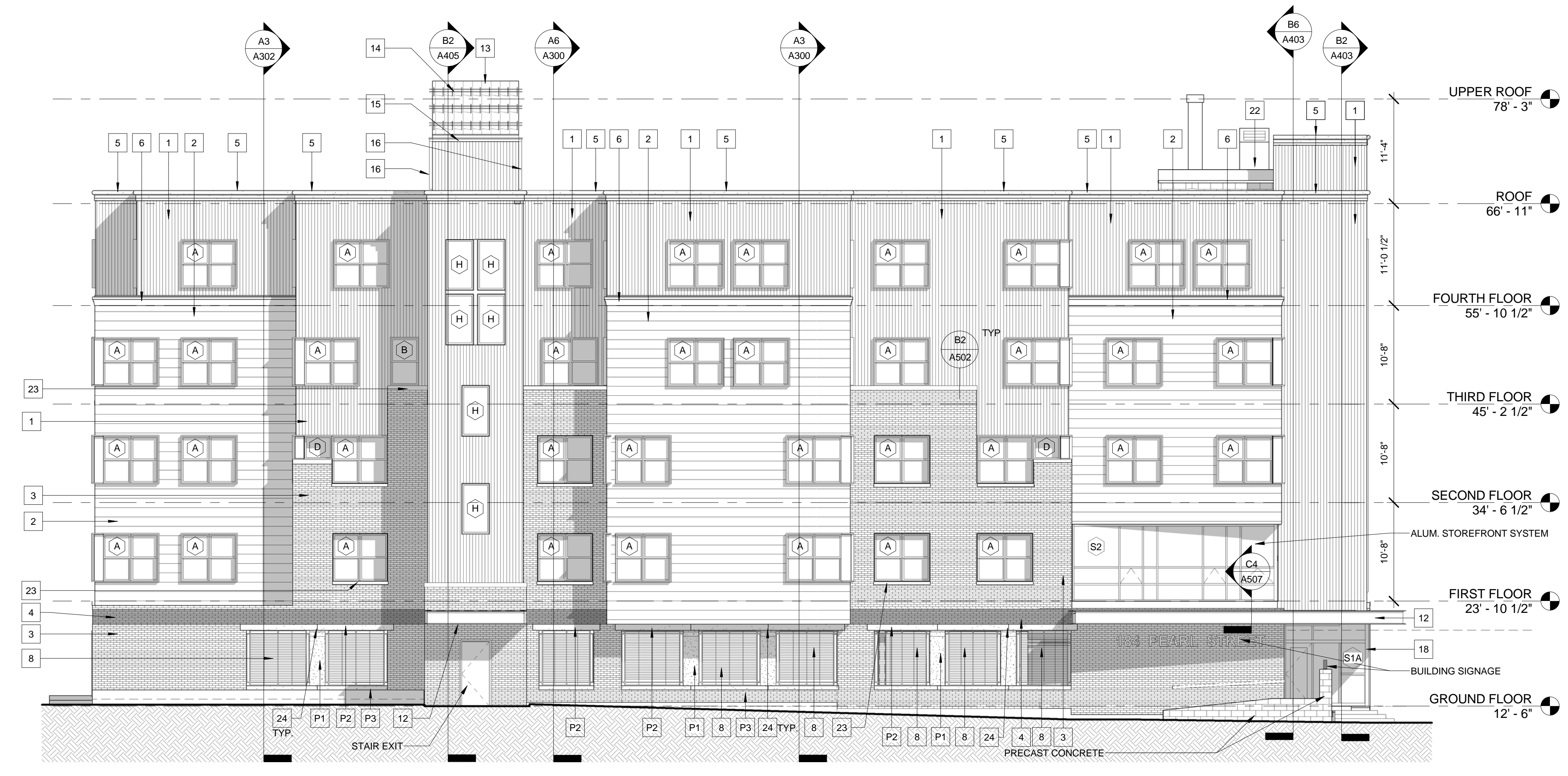
C6 EXTERIOR ELEVATION NORTH - A WING 1/8" = 1'-0"