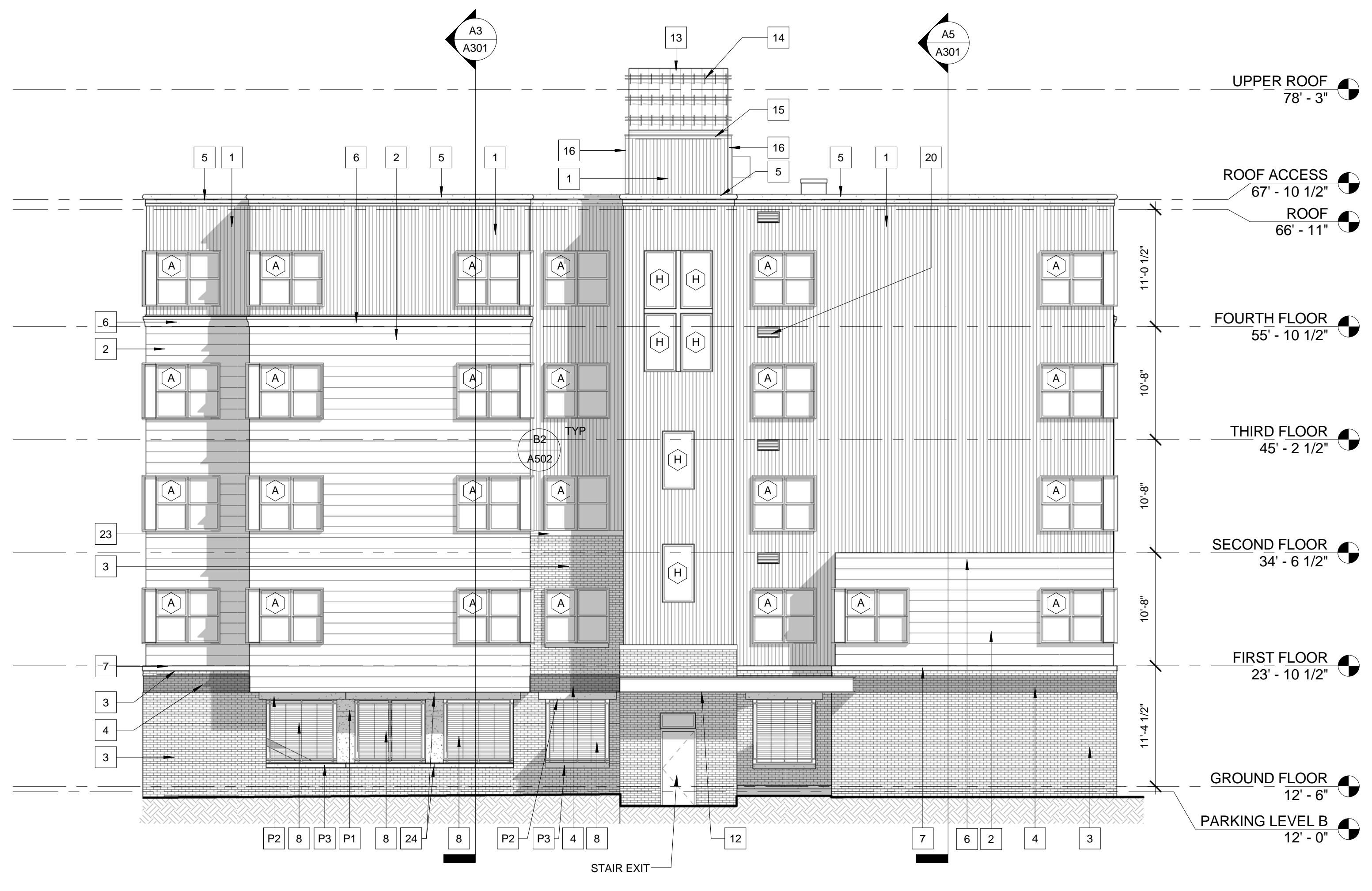
A4 EXTERIOR ELEVATION WEST - B WING 1/8" = 1'-0"