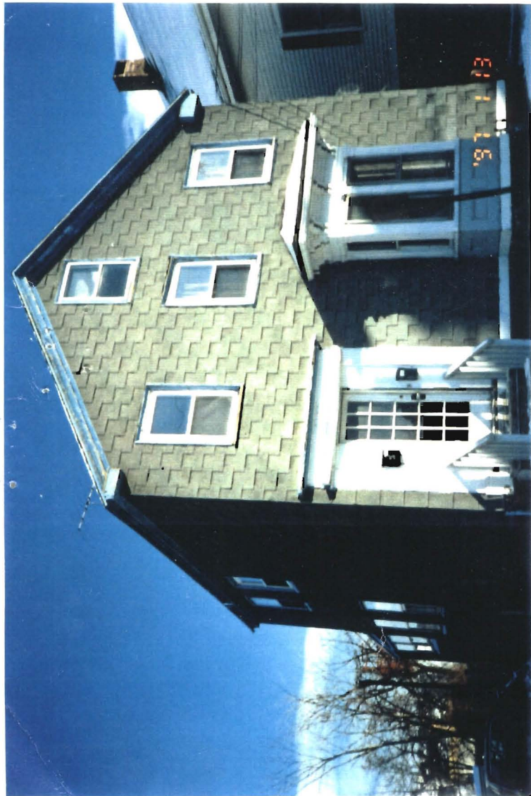
35 CEDAR STREET