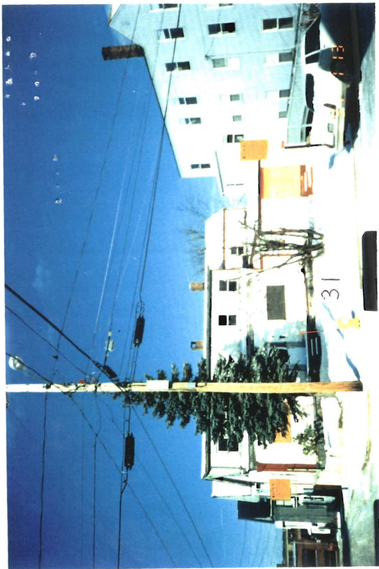
31 CEDAR STREET