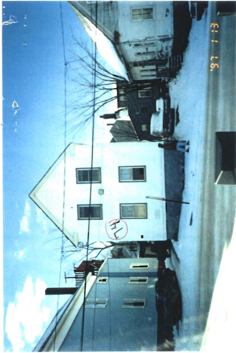
74 Chestnut Street

2 story white wood house-very long building