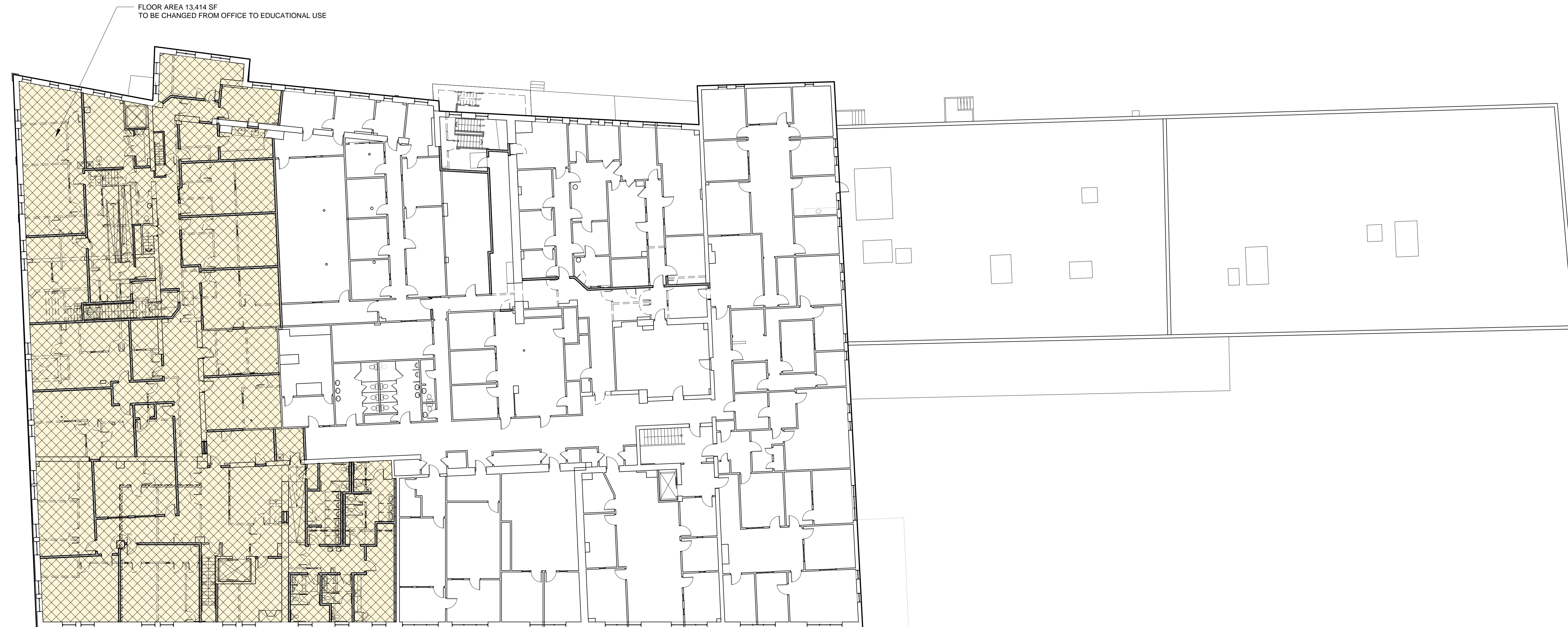
2 SECOND FLOOR PLAN 1/16" = 1'-0"