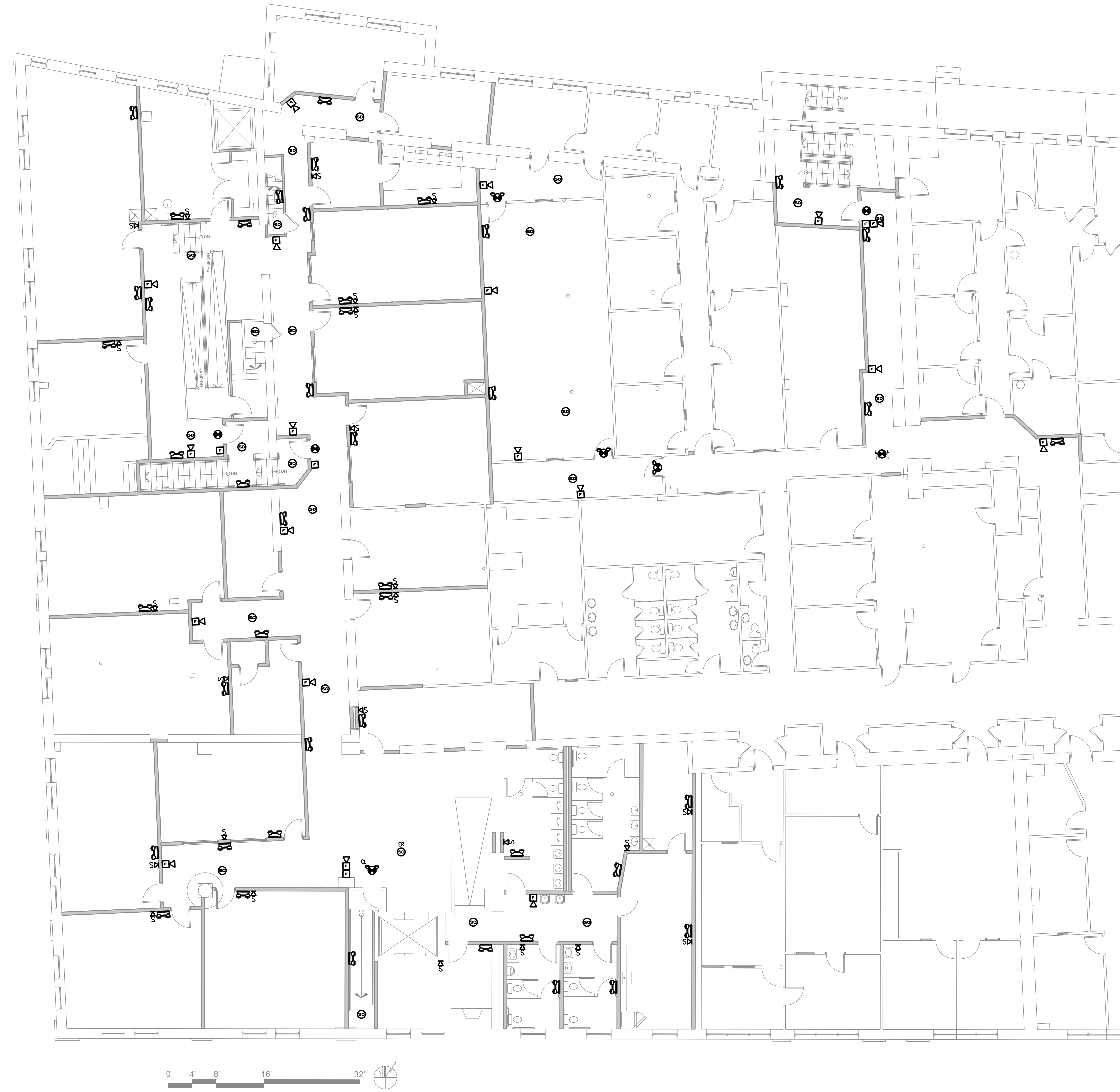
SECOND FLOOR PARTIAL PLAN SCALE: 3/32" = 1'-0"