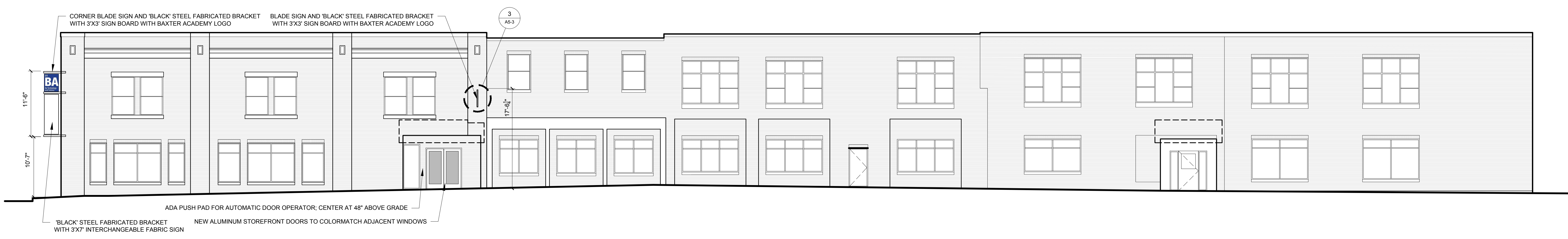
3 LANCASTER STREET ELEVATION 1/8" = 1'-0"