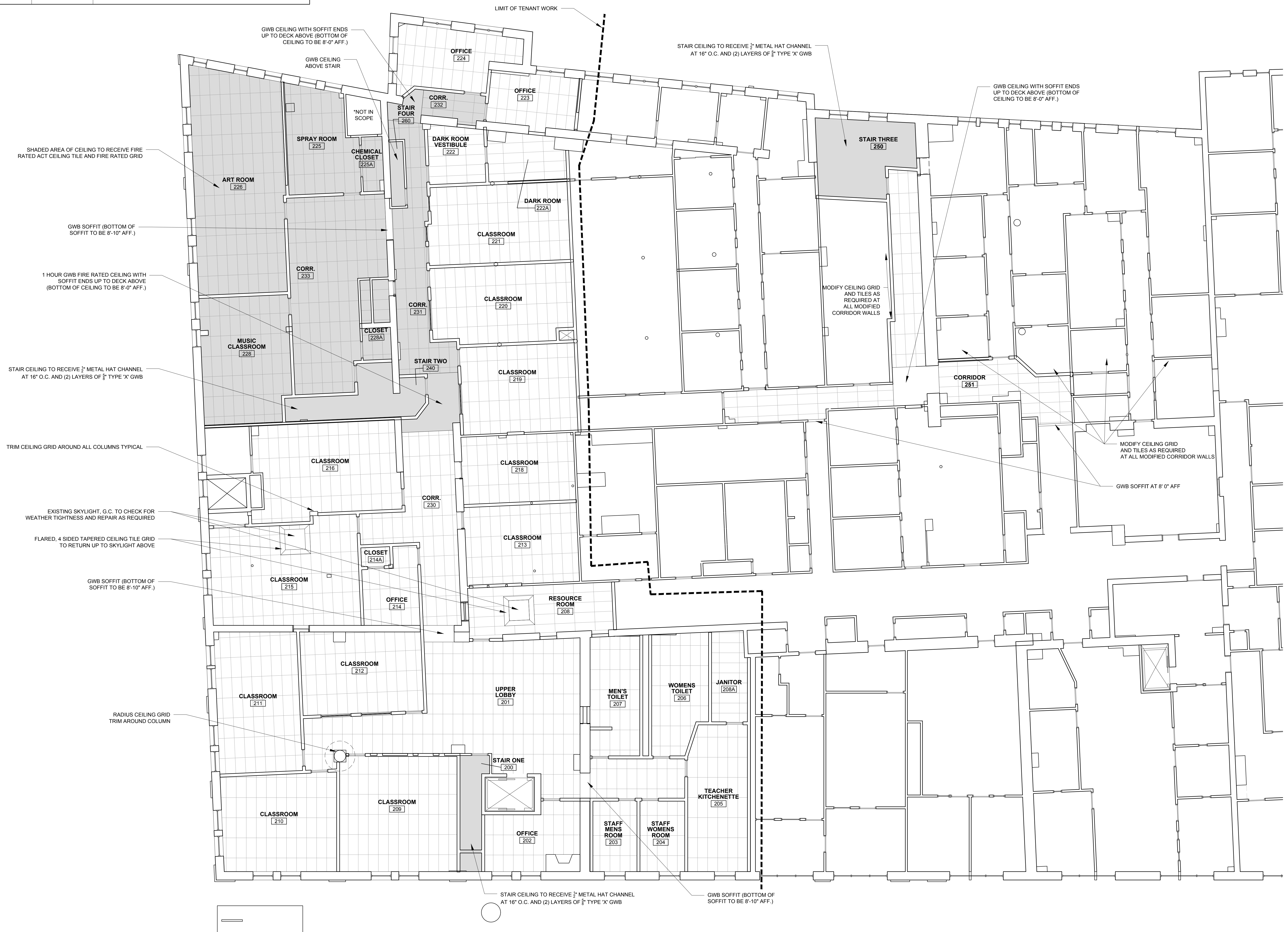
1 SECOND FLOOR REFLECTED CEILING PLAN 1/8" = 1'-0"