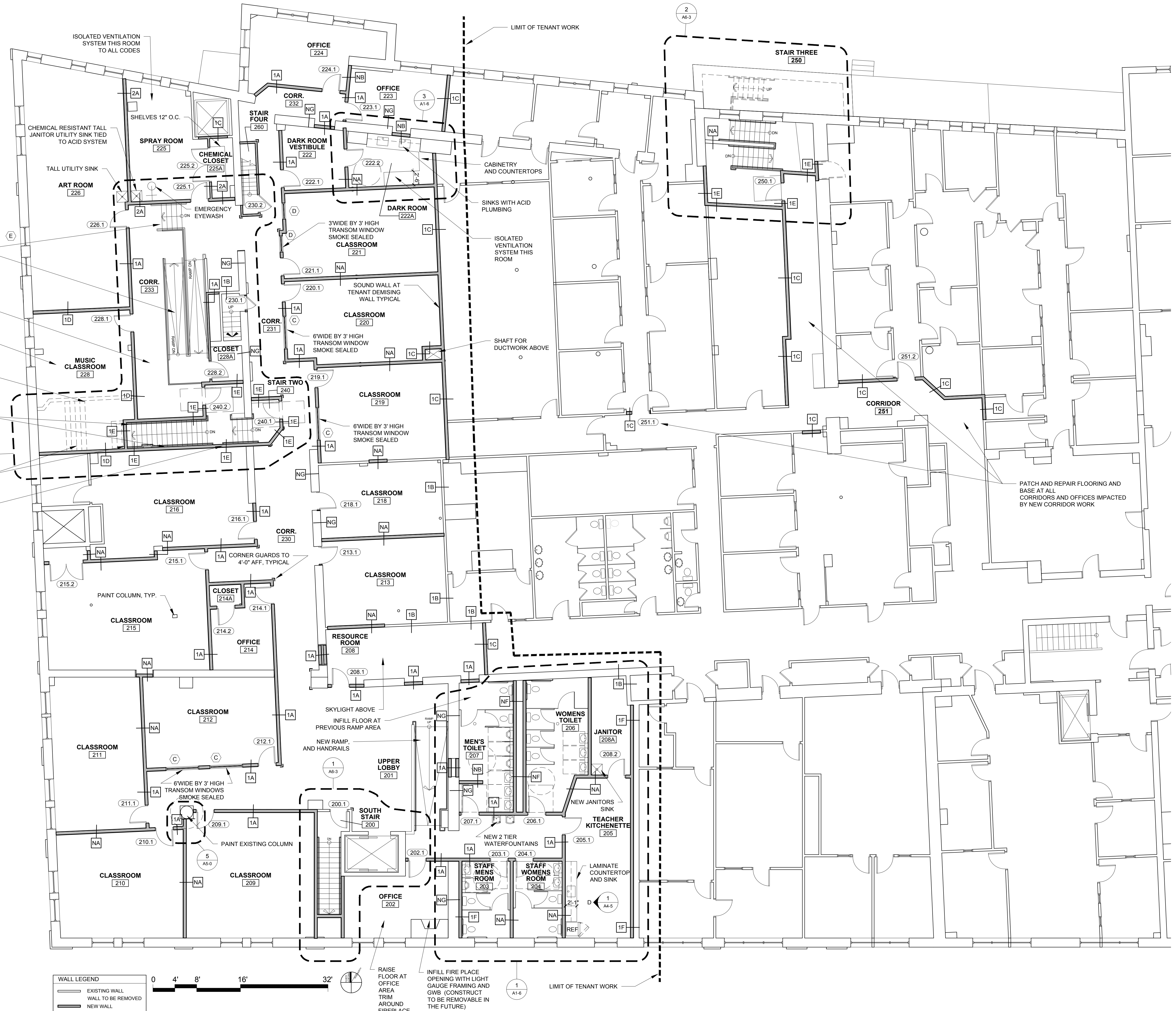
1 SECOND FLOOR PLAN 1/8" = 1'-0"