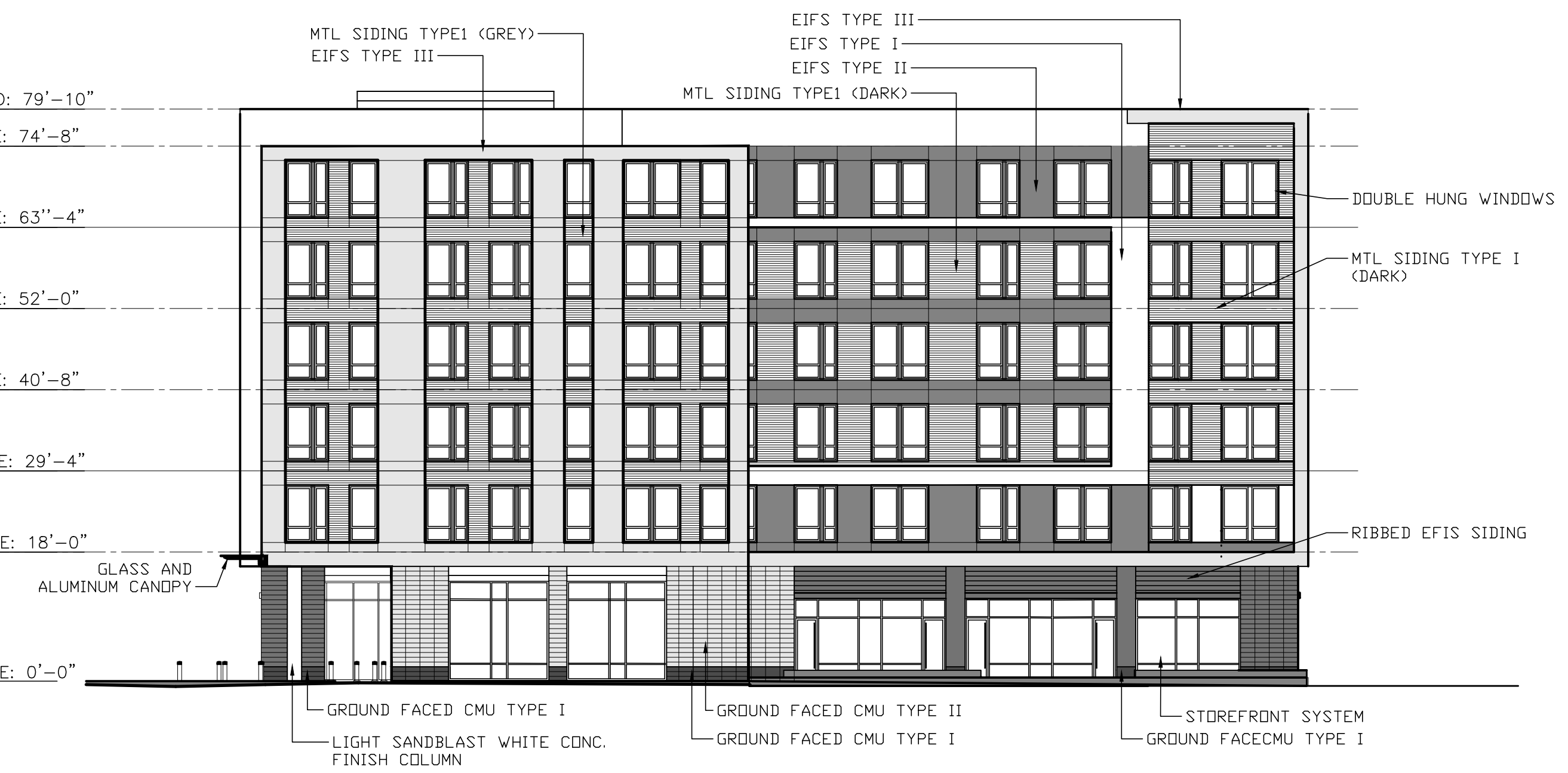
2 NORTH ELEVATION SCALE: 1/16" = 1'-0"