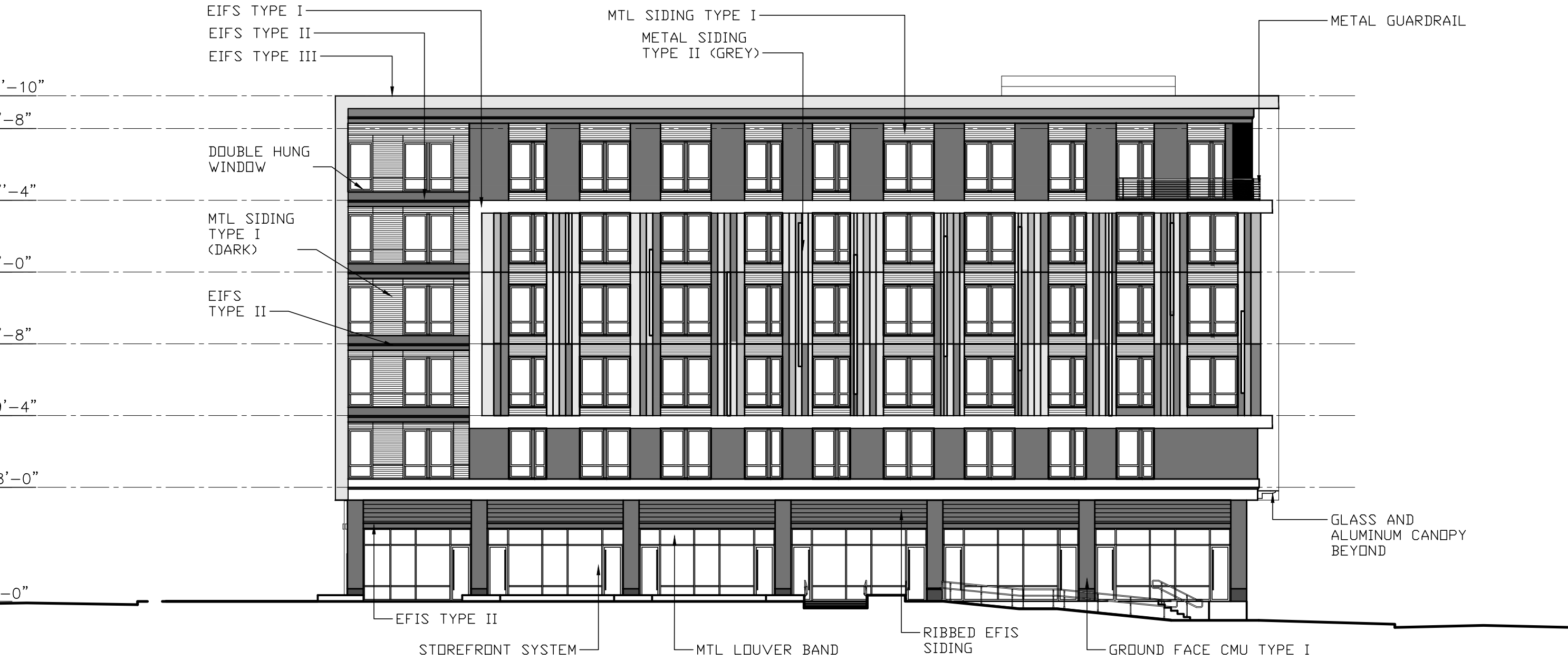
4 SOUTH ELEVATION SCALE: 1/16" = 1'-0"