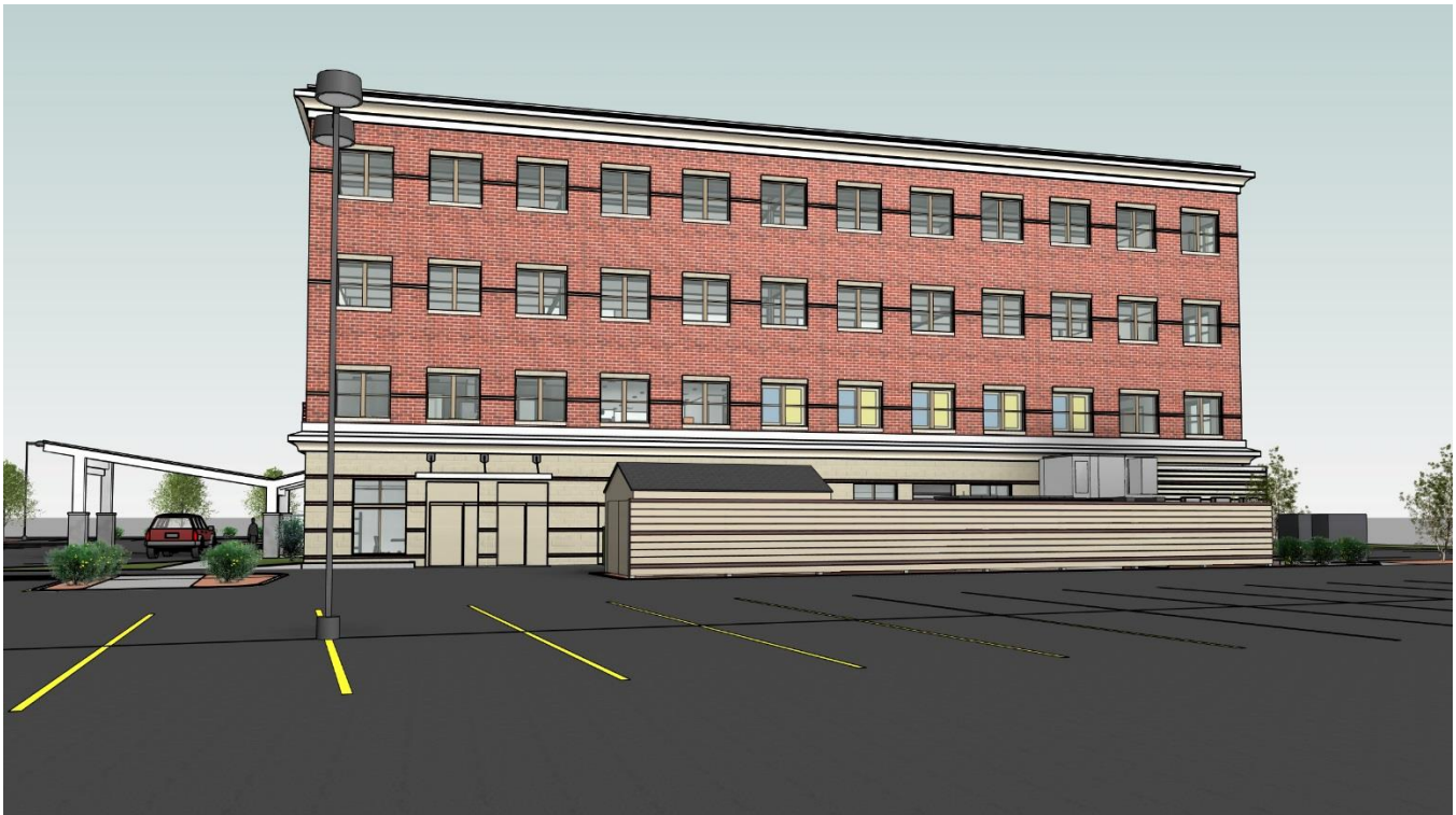
Southerly side of building facing the existing Bayside Trail with proposed screened-in exterior equipment area.