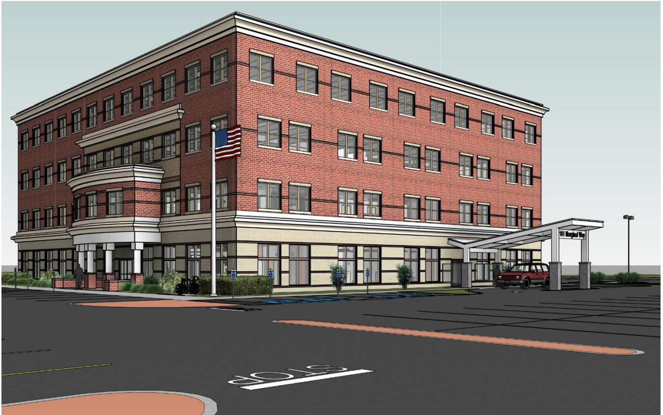
Westerly corner of building with proposed patient drop off area shown to the right.