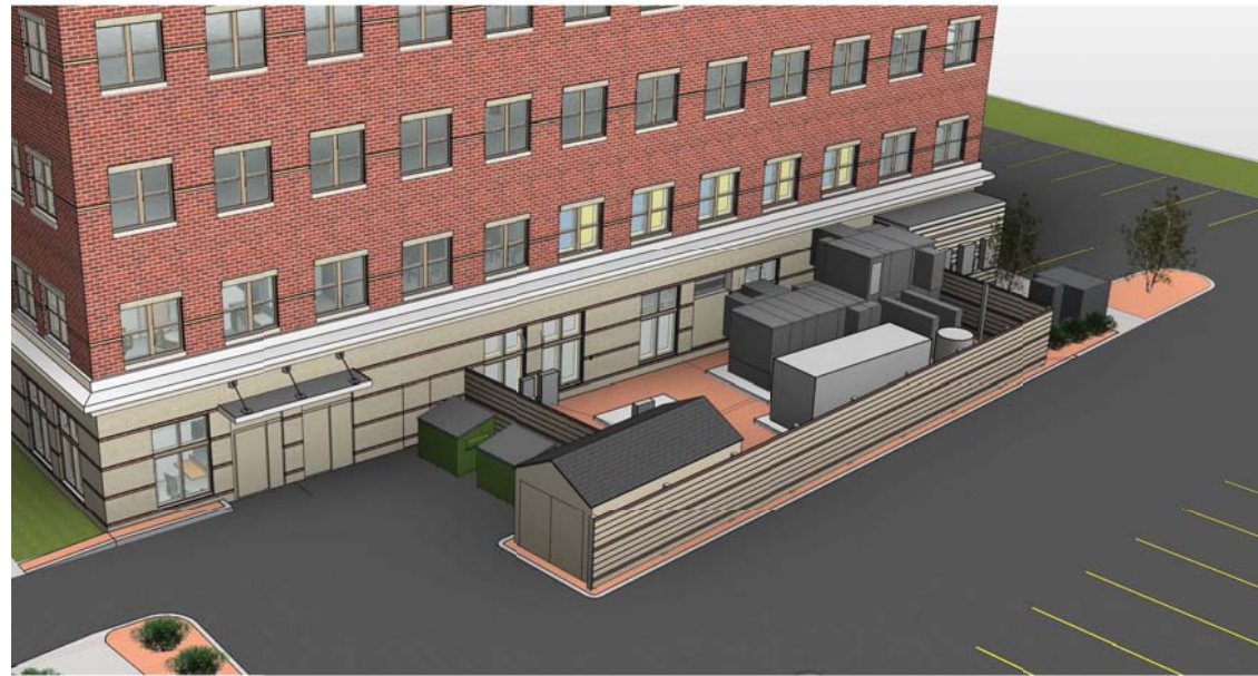
1 BACK OF BUILDING PERSPECTIVE