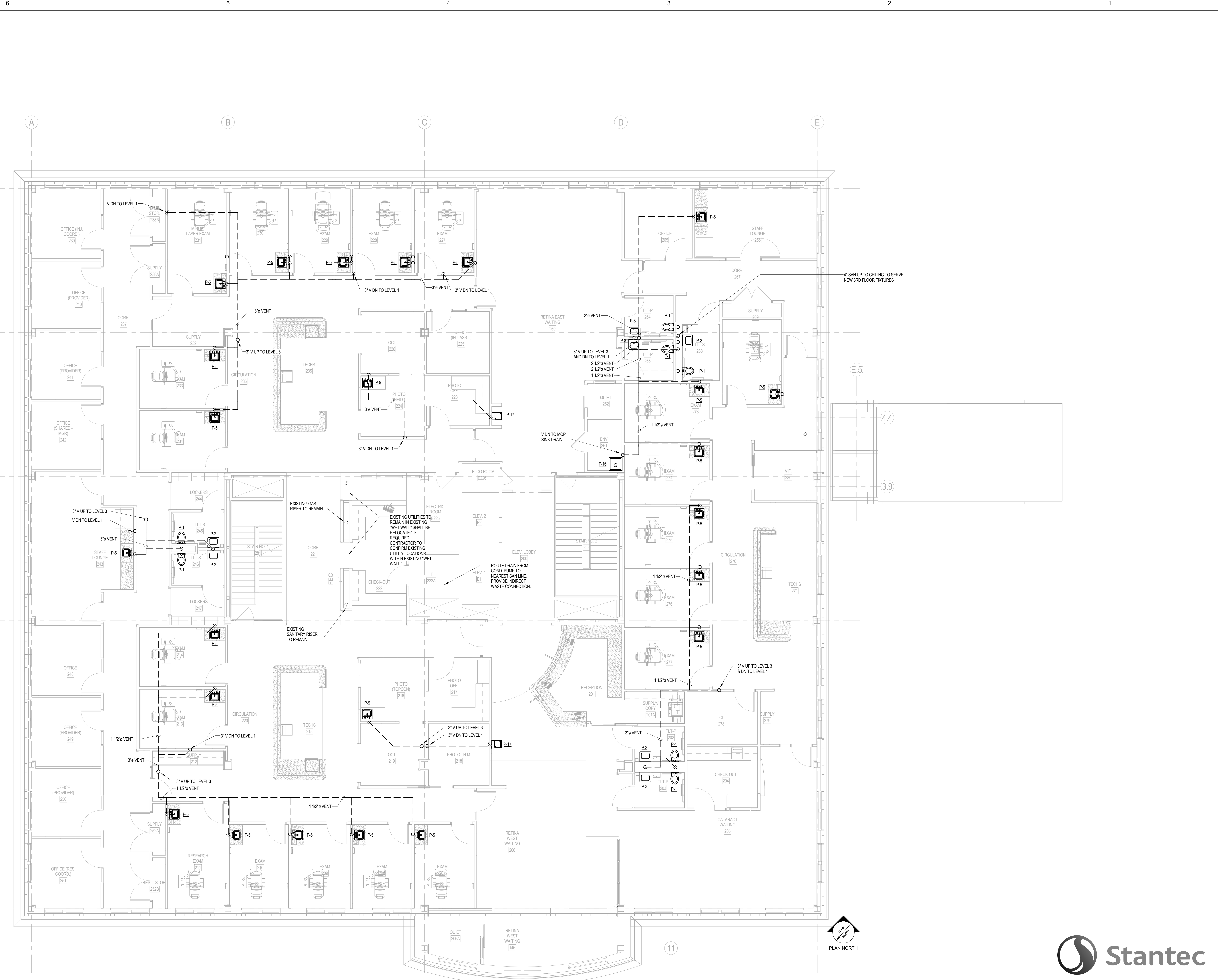
1 PLUMBING SANITARY & VENT LEVEL 2 NEW PLAN 3/16" = 1'-0"

Stantec Consulting Services Inc. 492 Payne Road Scarborough Court Scarborough, ME 04074-8929 Tel: (207) 883-3355 / Fax: (207) 883-3376 www.stantec.com