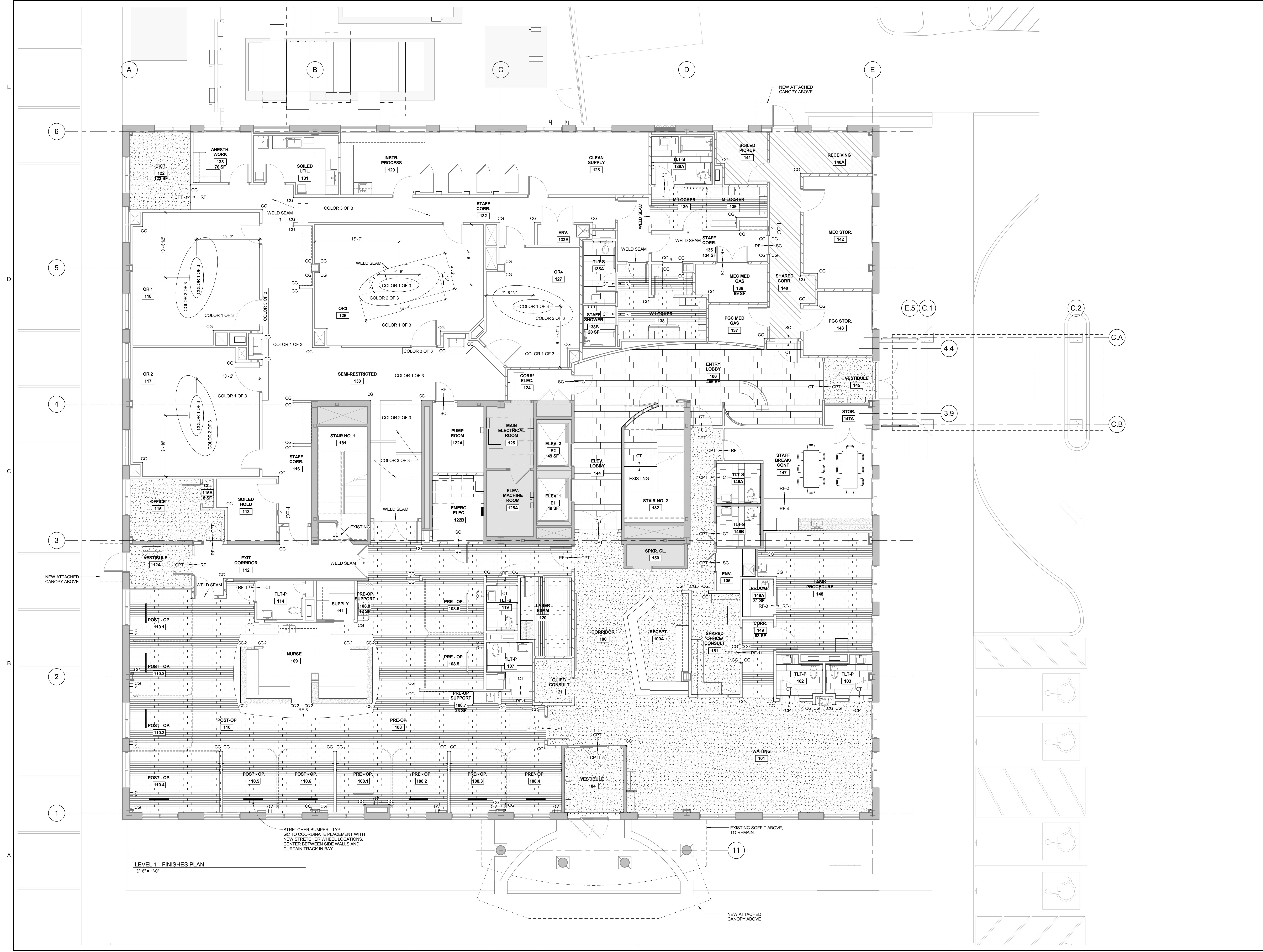
LEVEL 1 - FINISHES PLAN 3/16" = 1'-0"

STRETCHER BUMPER - TYP. GC TO COORDINATE PLACEMENT WITH NEW STRETCHER WHEEL LOCATIONS. CENTER BETWEEN SIDE WALLS AND CURTAIN TRACK IN BAY