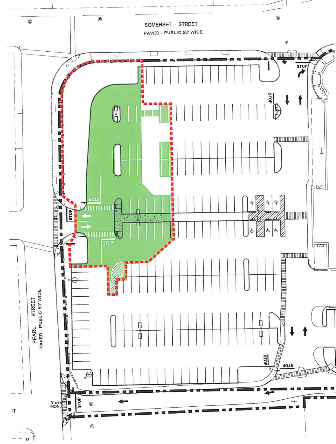
PROPOSED CONDITIONS IMPERVIOUS AREA TO BE CONSTRUCTED=14,836 SF

INCREASE IN IMPERVIOUS AREAS WITHIN LIMIT OF WORK ( - - - - )=6,618 SF