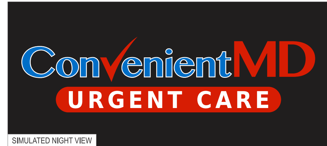
SIMULATED NIGHT VIEW