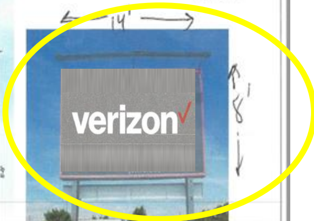
C FRONT VIEW - 16 SF Scale: 3/16" = 1'-0"