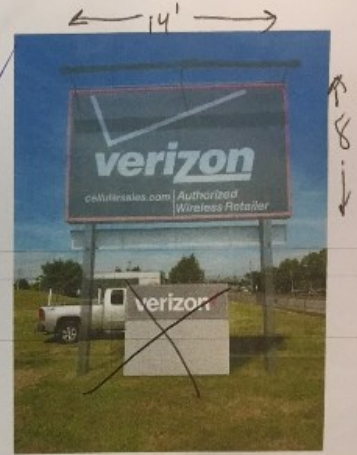
NEW MONUMENT SIGN