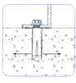
SLEEVE-ANCHOR MOUNTING DETAIL NOT TO SCALE

LOK-BOLT™ ANCHORING SYSTEM AS MFG BY POWERS INDUSTRIAL PRODUCTS (SINGLE UNIT) SLEEVE ANCHOR FOR ANCHORING INTO SOLID FLOW CONCRETE AND MASONRY SUBSTRATES; AVAILABLE IN CARBON STEEL AND TYPE 304 STAINLESS STEEL; SEVERAL HEAD STYLES SIZE RANGE: 1/2" DIA. x 5/8" TO 3/4" DIA. x 7 1/2"