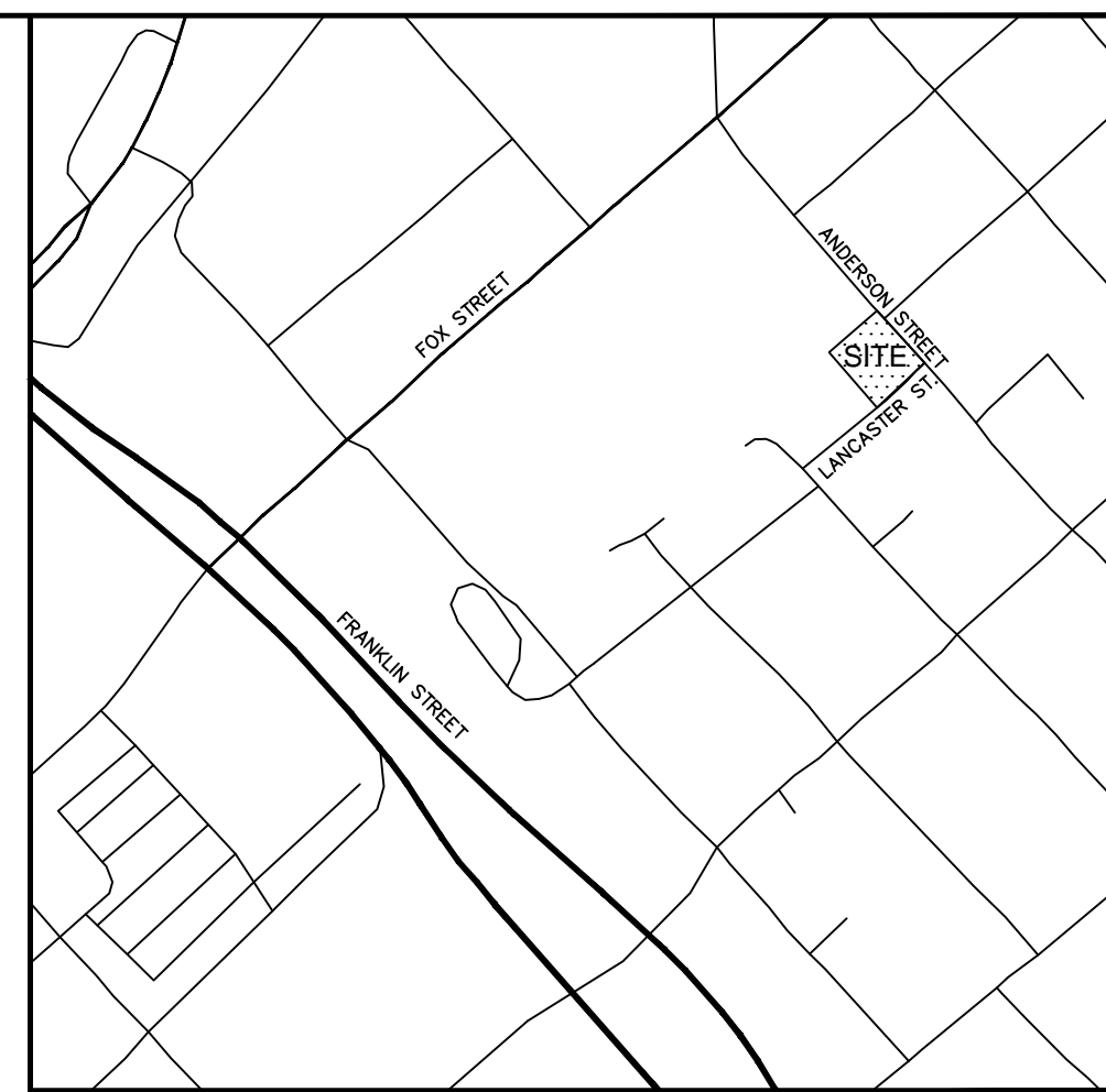
VICINITY MAP No Scale