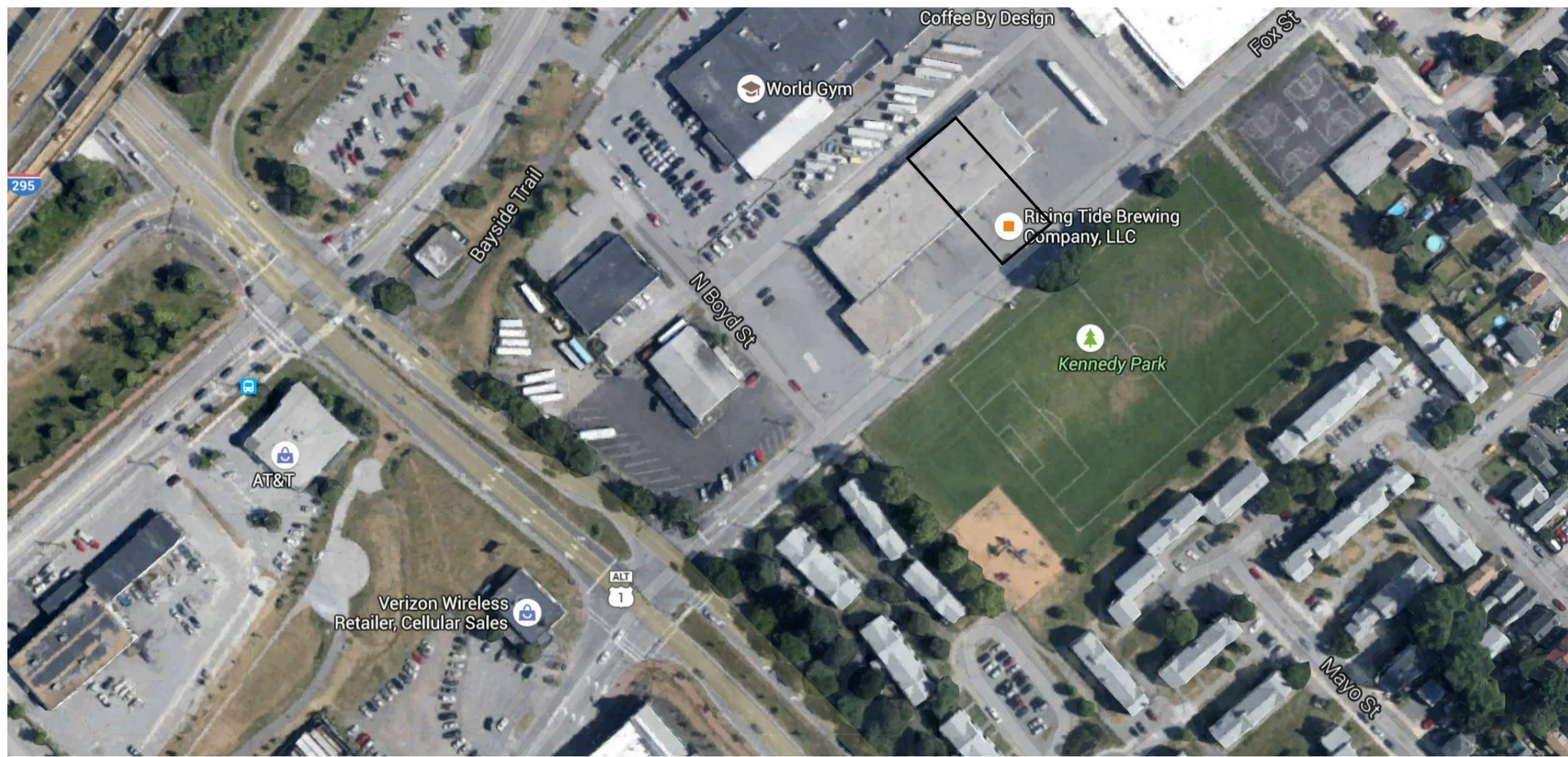
RISING TIDE BREWERY | 103 FOX STREET, PORTLAND (SHARED PARKING WITH OTHER BUILDING TENANTS)