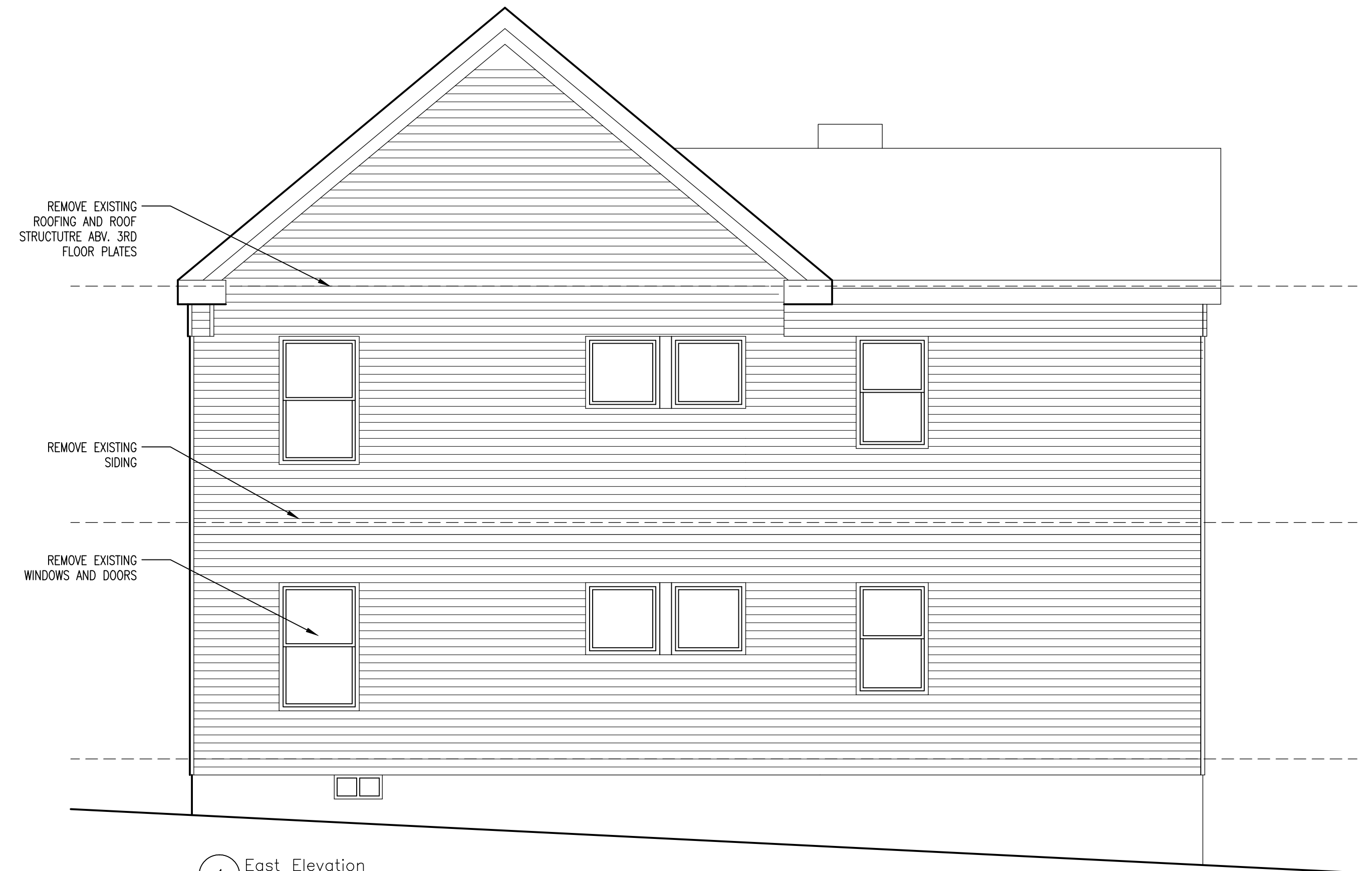
4 East Elevation Scale: 1/4" = 1'-0"