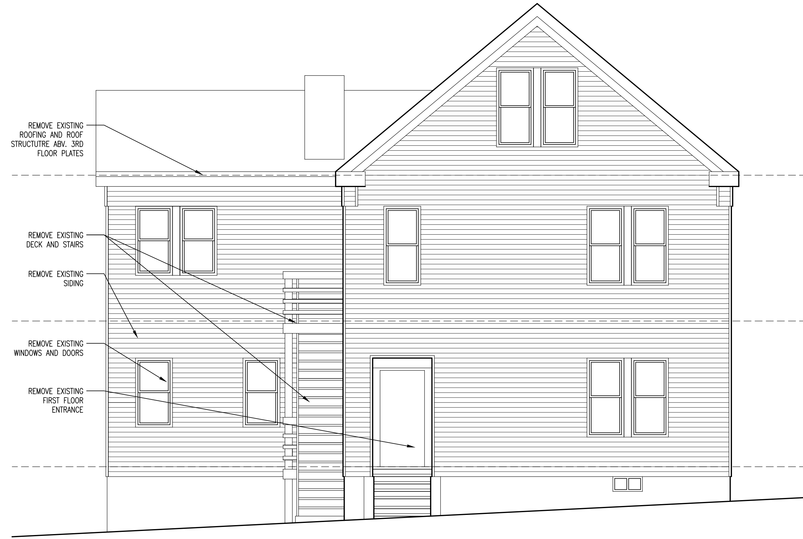
2 West Elevation Scale: 1/4" = 1'-0"