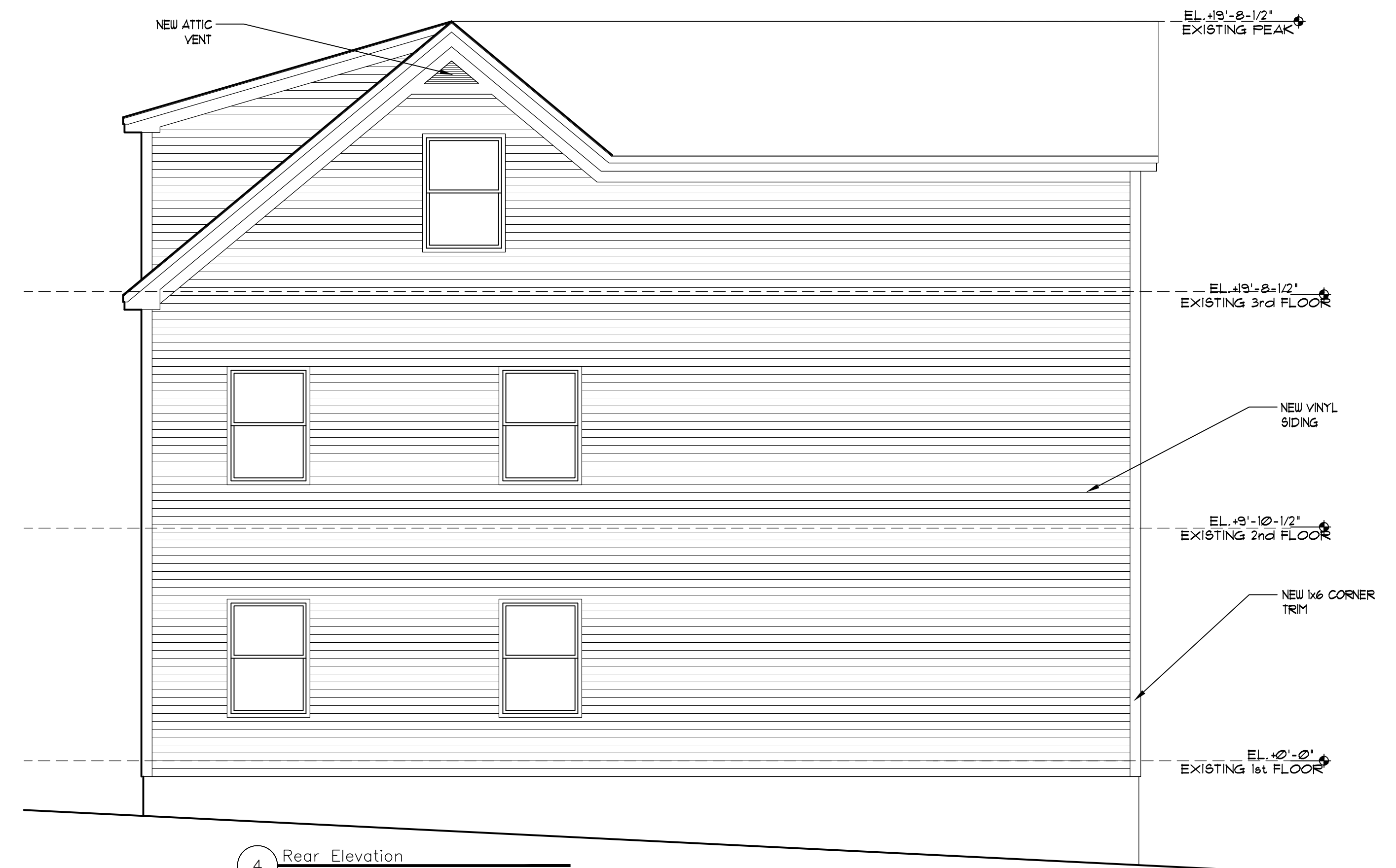
4 Rear Elevation Scale: 1/4" = 1'-0"