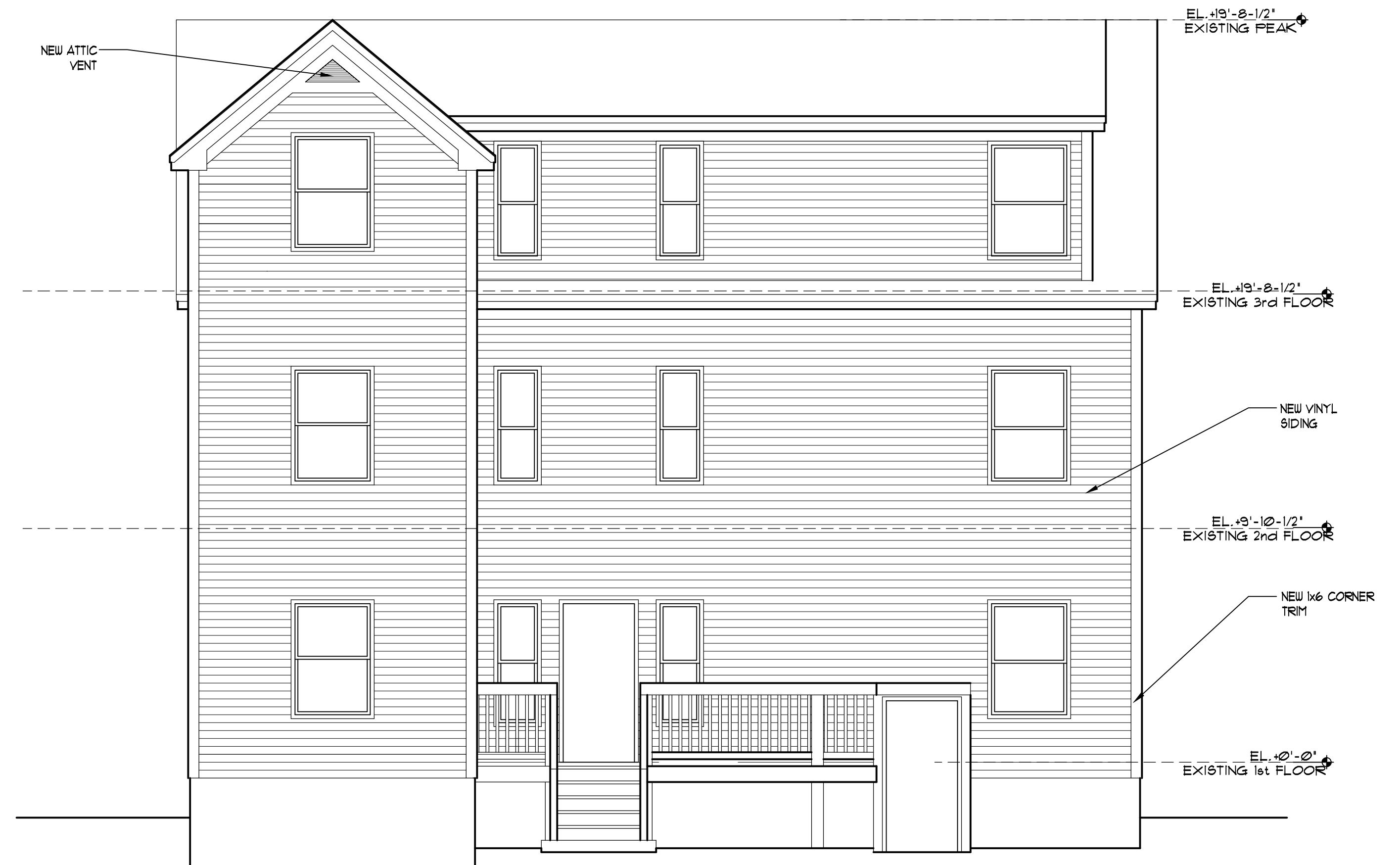
2 Left Elevation Scale: 1/4" = 1'-0"