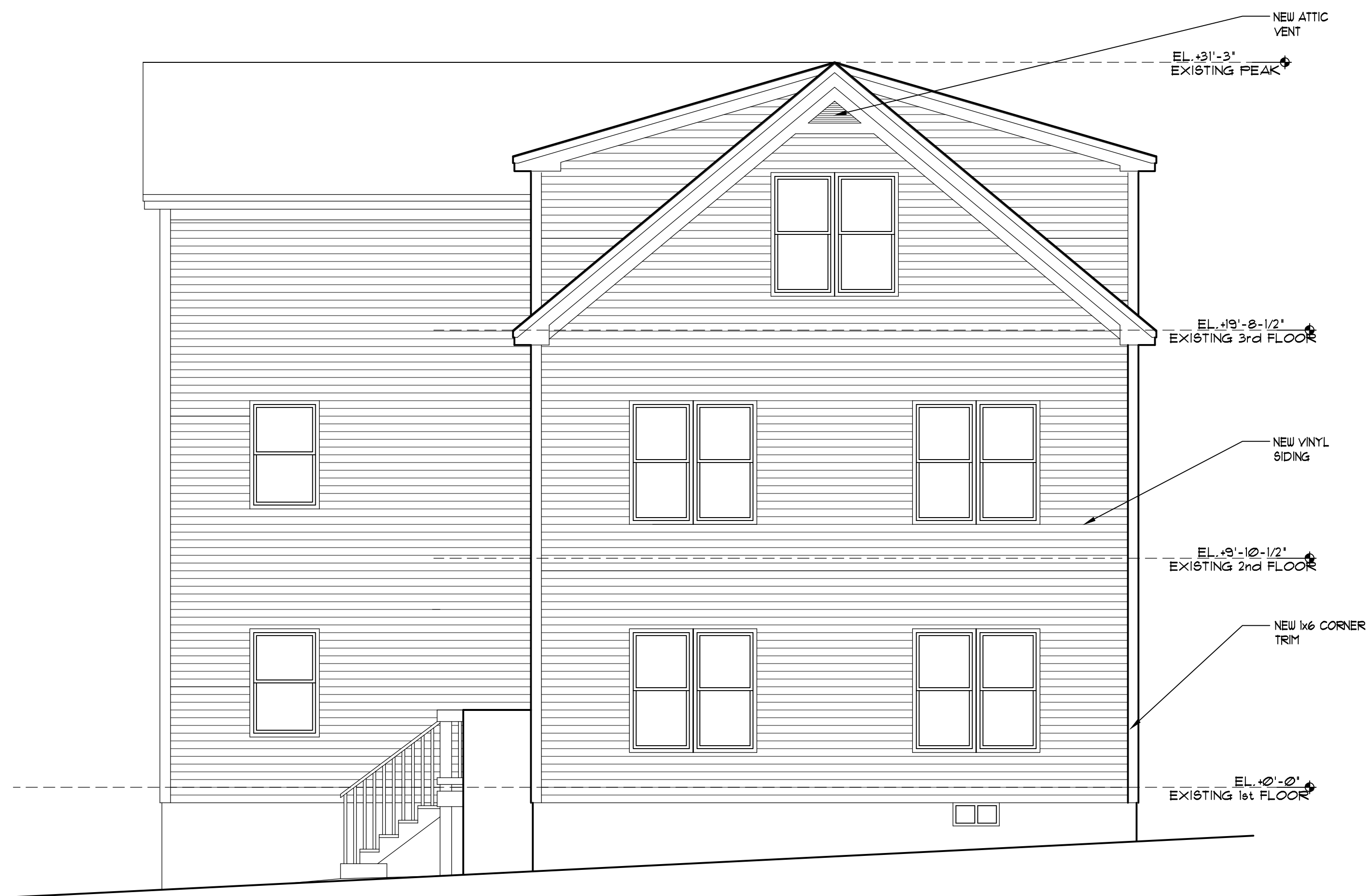
1 Front Elevation Scale: 1/4" = 1'-0"