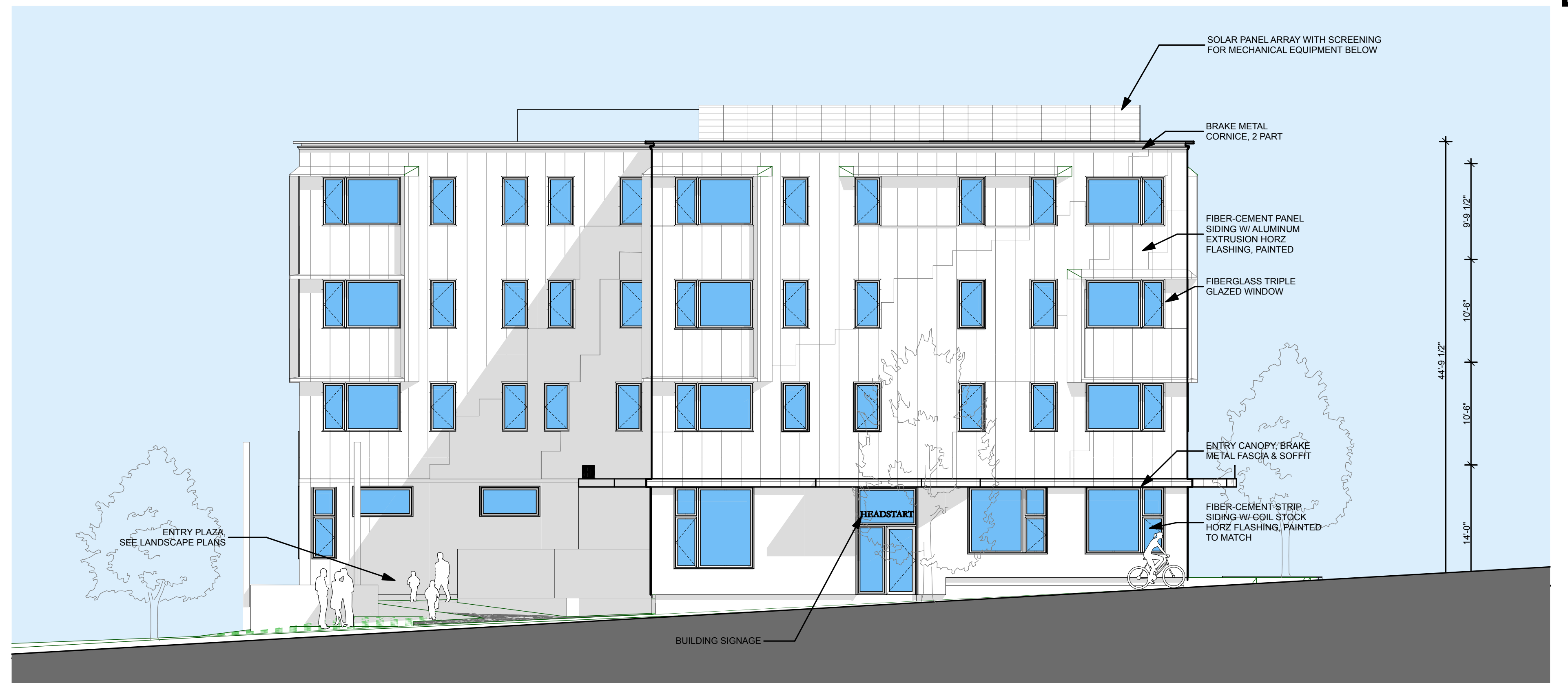
1 SOUTHWEST ELEVATION SCALE: 1/8" = 1'-0"