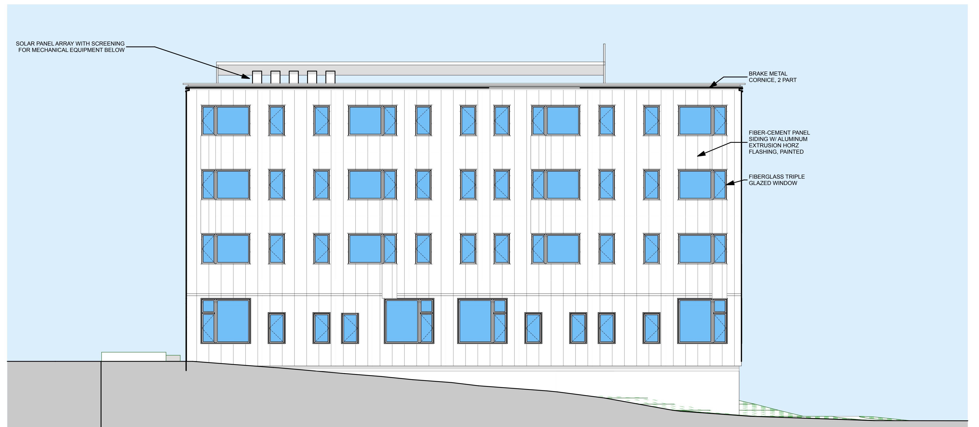
2 NORTHEAST ELEVATION SCALE: 1/8" = 1'-0"