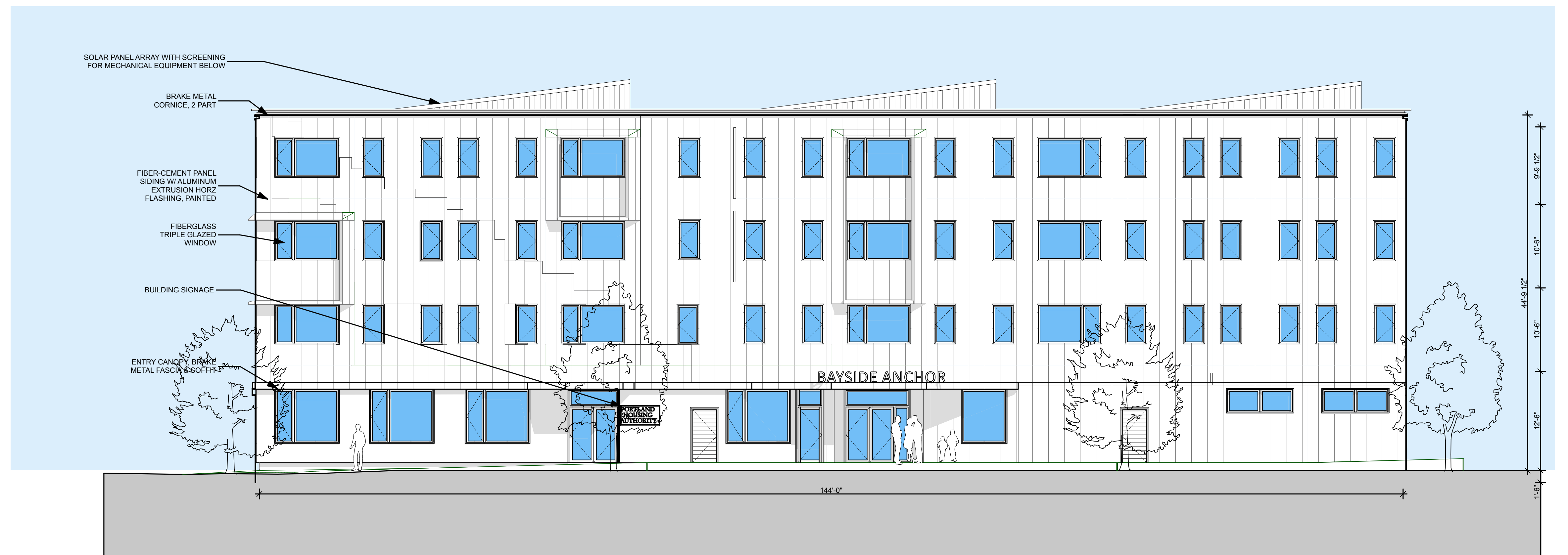
2 SOUTHEAST ELEVATION SCALE: 1/8" = 1'-0"