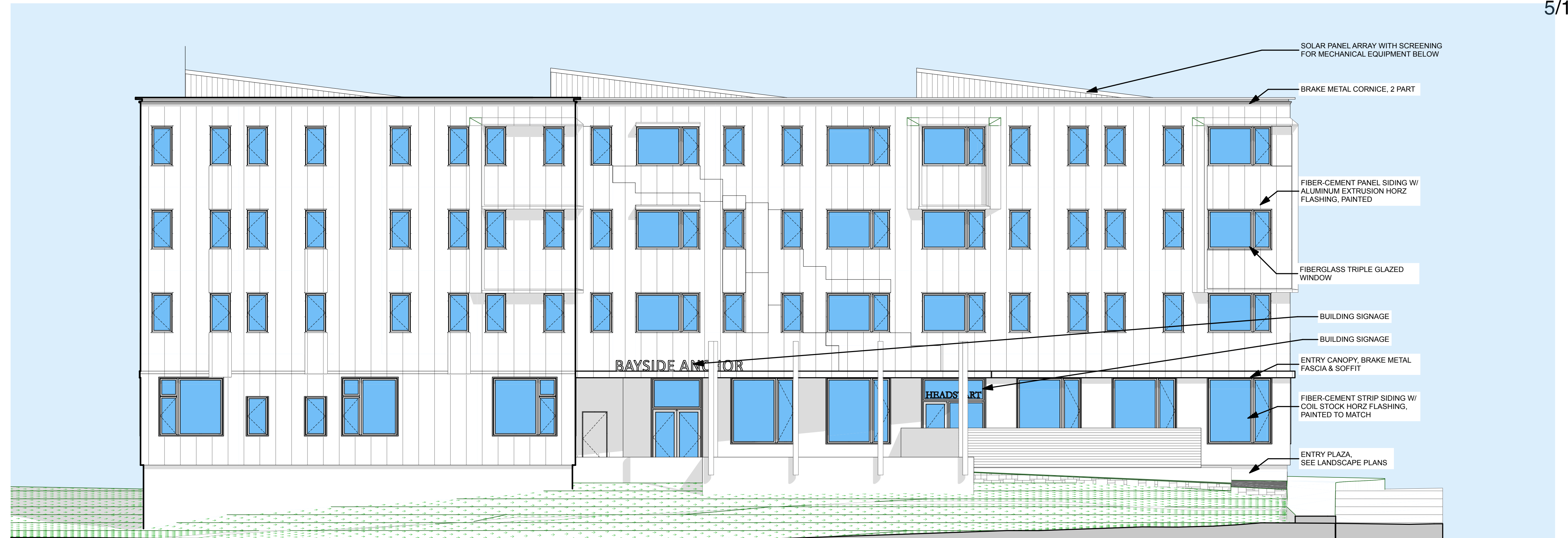
1 NORTHWEST ELEVATION SCALE: 1/8" = 1'-0"