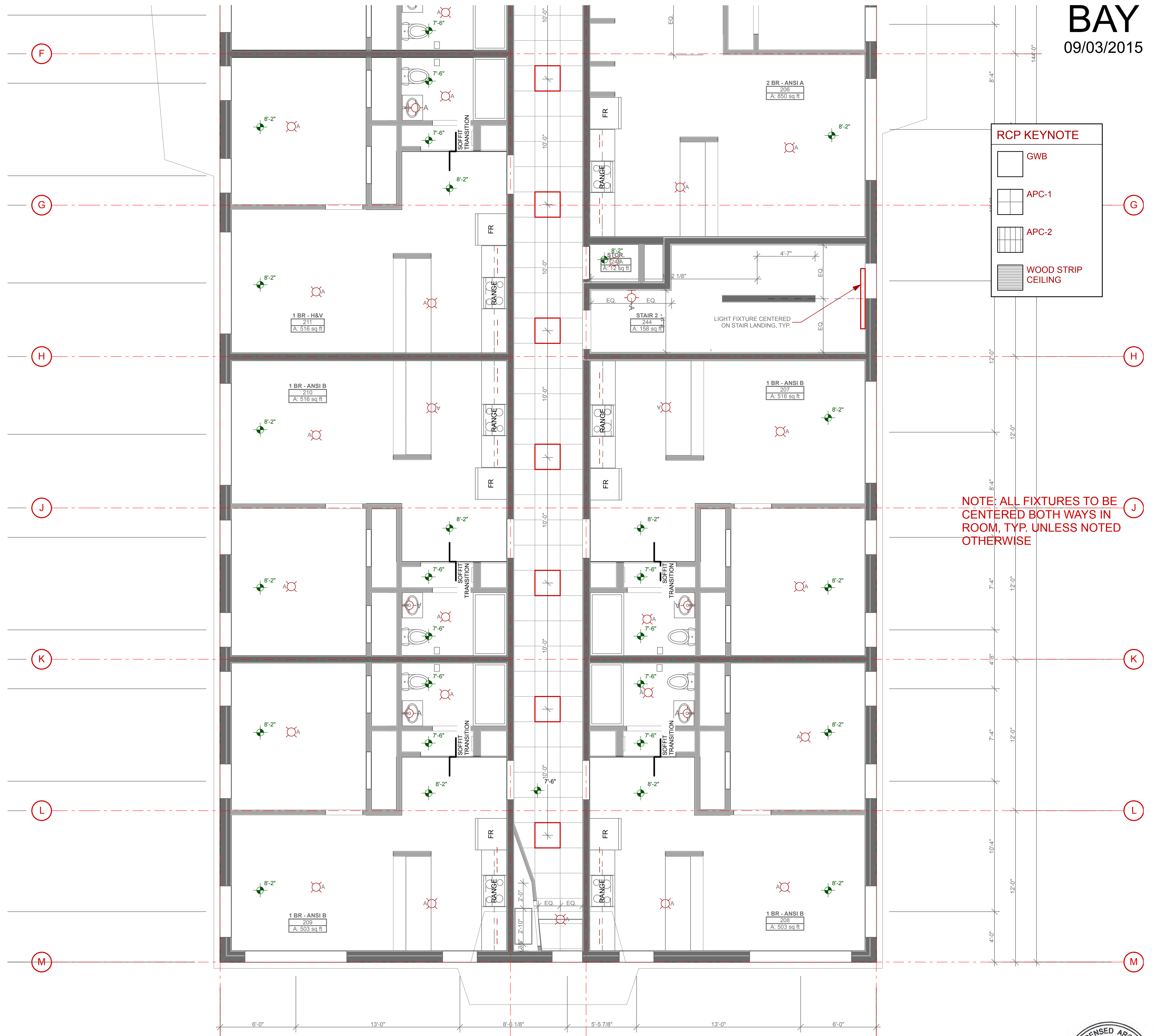
1 TYP. UPPER FLOOR RELECTED CEILING PLAN SCALE: 1/4" = 1'-0"