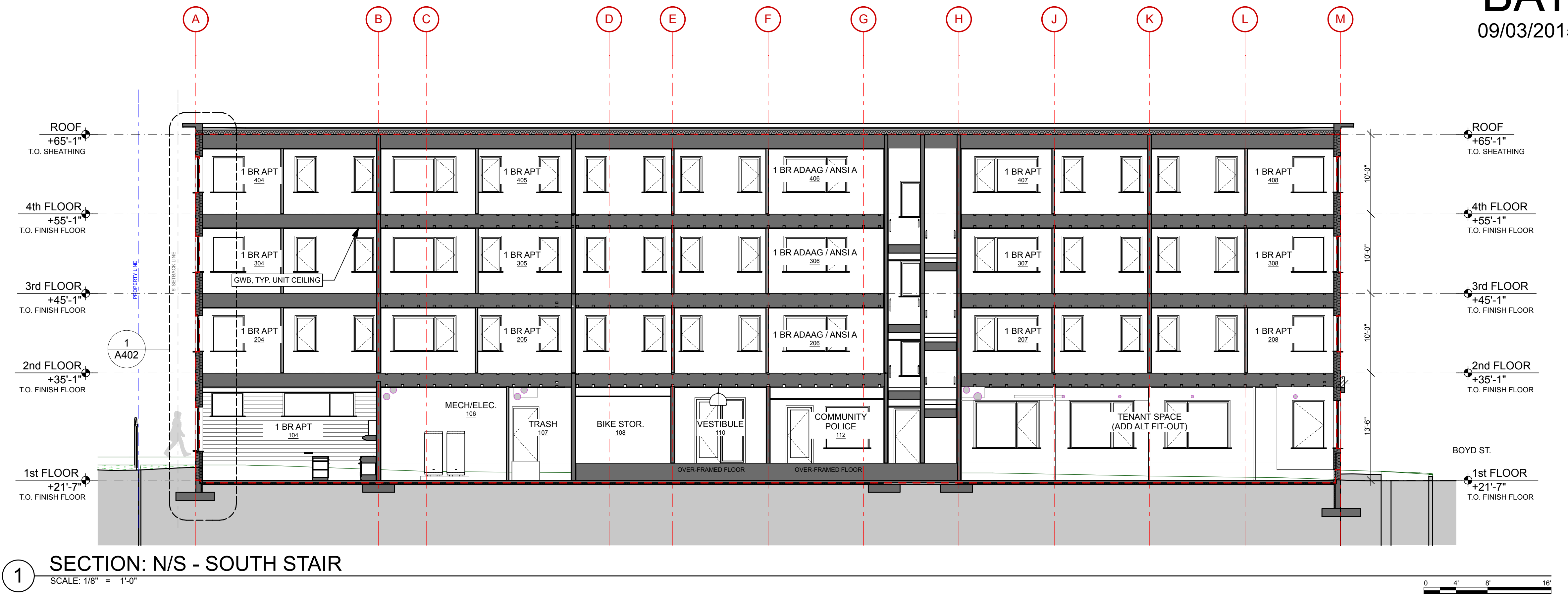
1 SECTION: N/S - SOUTH STAIR SCALE: 1/8" = 1'-0"