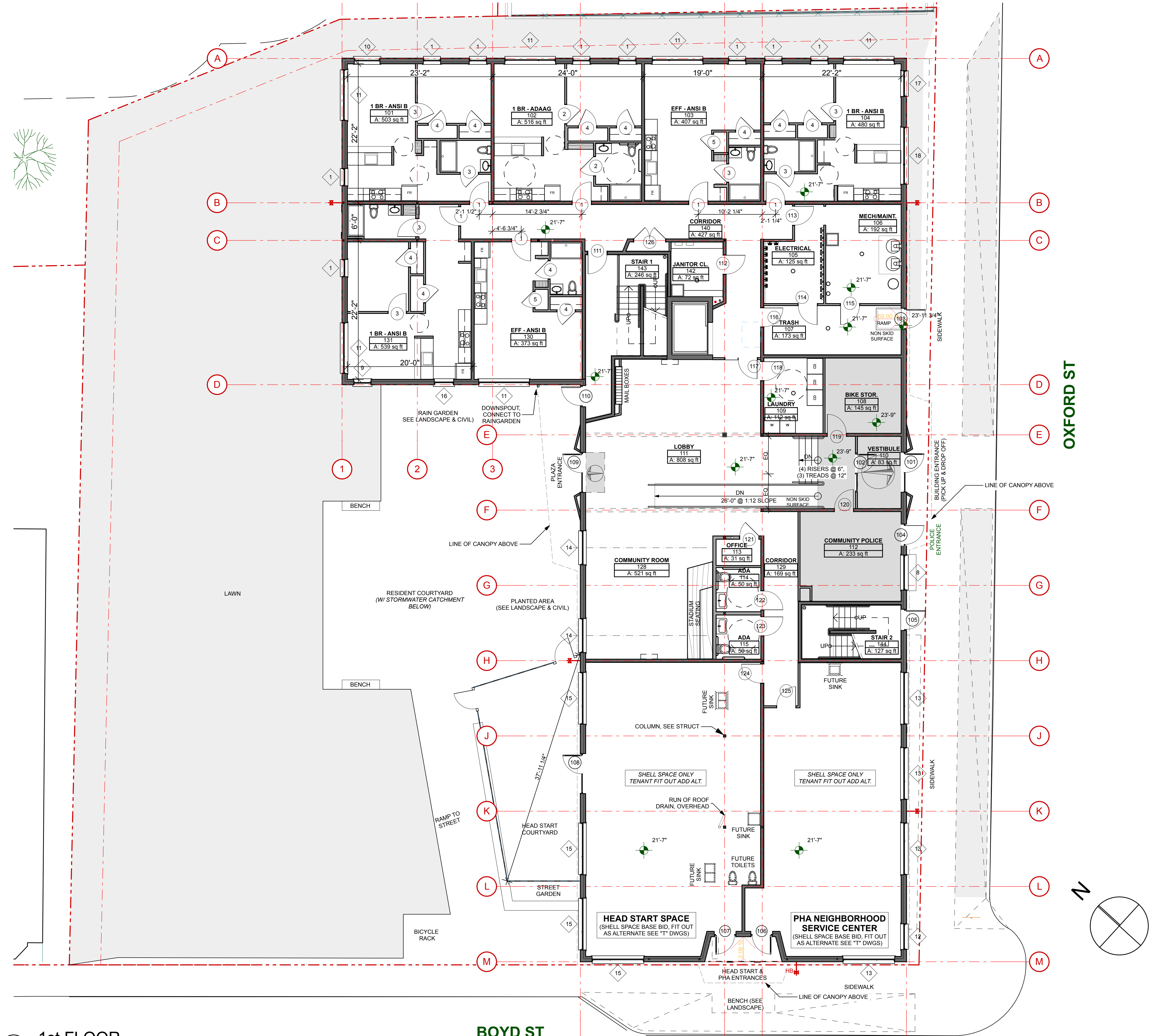
1 1st FLOOR SCALE: 1/8" = 1'-0"