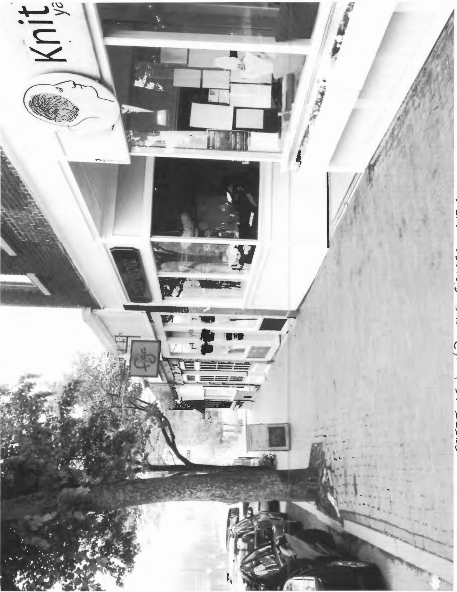
STREET VIEW w/ Previous Signage 247 Congress