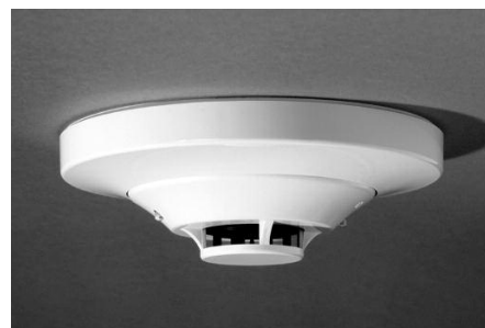
SK-Heat (base included)

SK-Heat-HT: High temperature heat sensor 135°F - 190°F (57°C - 88°C)