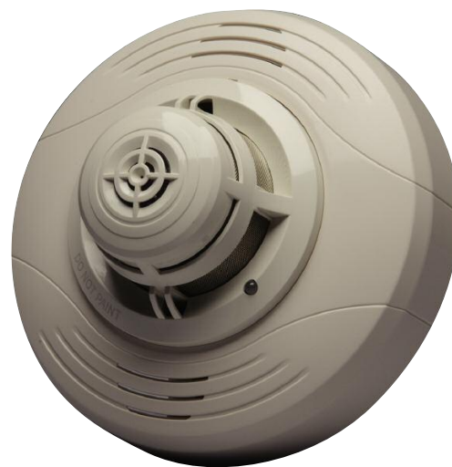
SK-Fire-CO installed in a B200S/B200S-LF Sounder Base (sold separately)