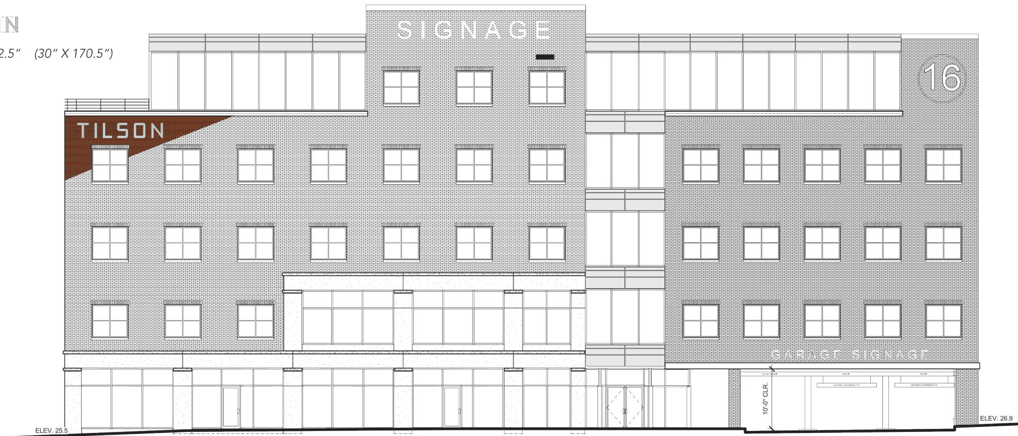
2 | North Elevation