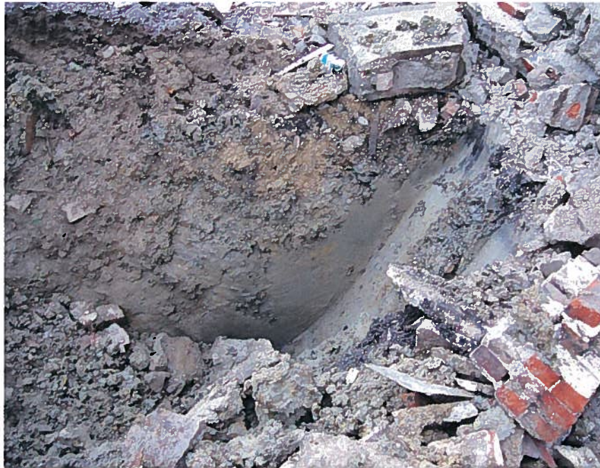
Photograph 4. Test Hole No. 2, looking east with naturally deposited marine clay visible on the front and right sidewalls (4/18/07).