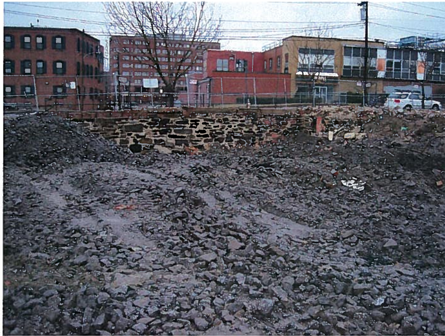
Photograph 1. Space formerly occupied by The Breakaway Tavern, looking south at India Street and the Jordan's Meats property. The basement foundation wall is visible with partial filling of the "below grade" space (4/18/07).