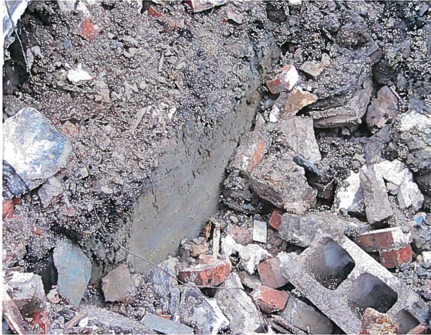
Photograph 3. Test Hole No. 1, looking north with naturally deposited marine clay visible on the left sidewall (4/18/07).