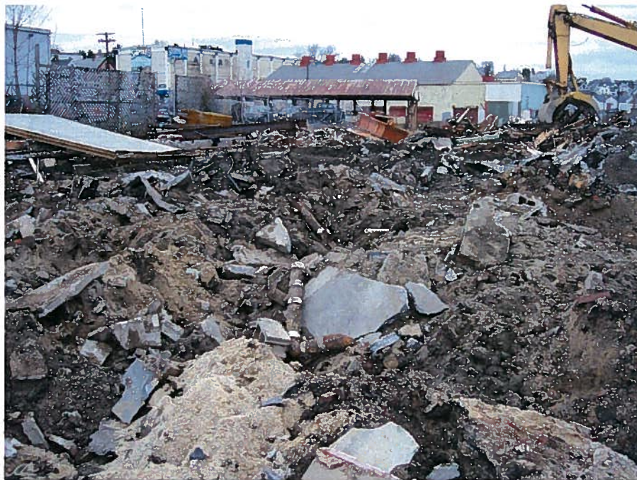
Photograph 2. Space formerly occupied by The Breakaway Tavern, looking north at the Shipyard Brewery with the Micucci property to the left. The "at-grade" portion of the structure and floor slab has been demolished (4/10/07).