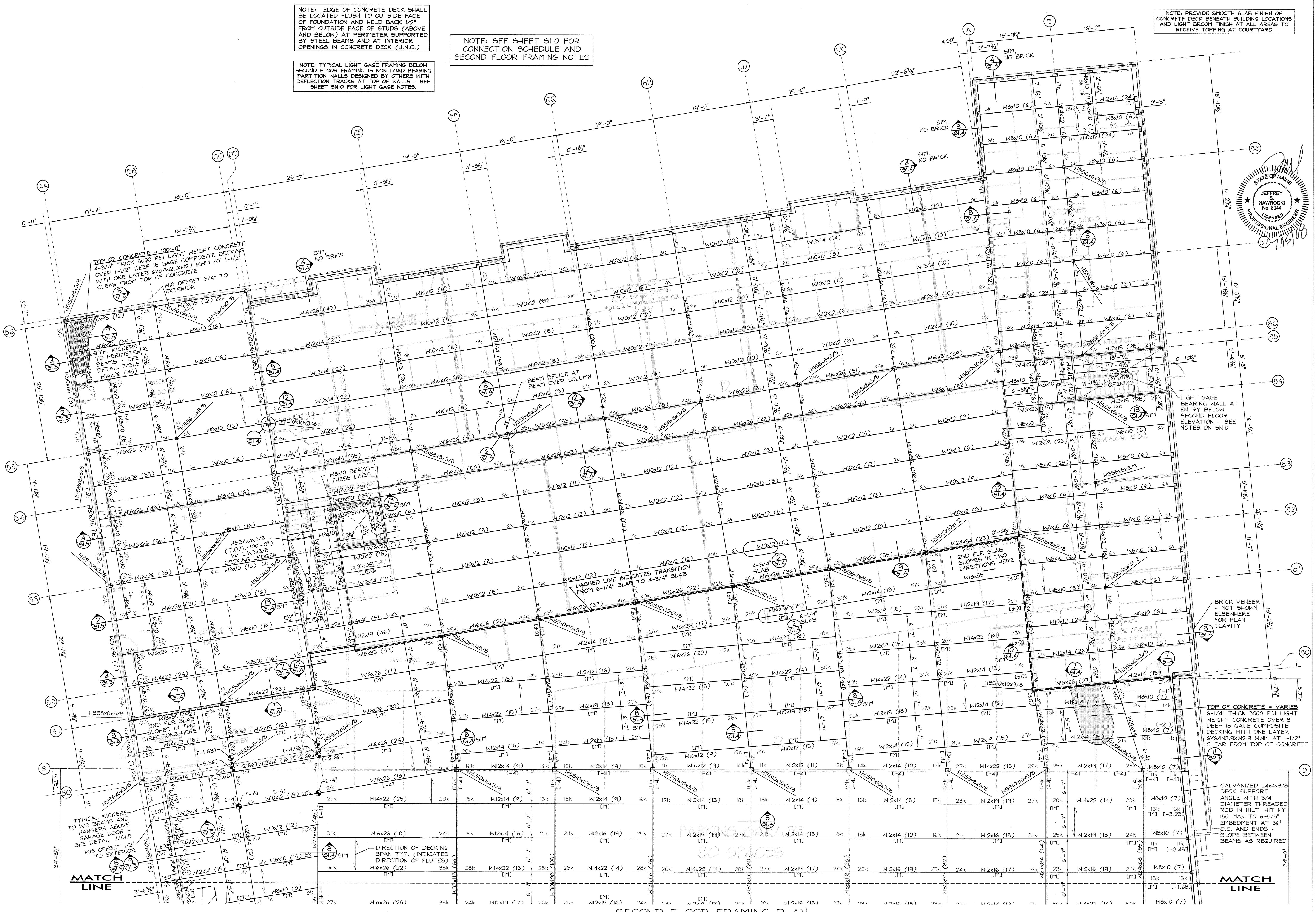
SECOND FLOOR FRAMING PLAN - BUILDING 2 S1.1 Scale: 1/8" = 1'