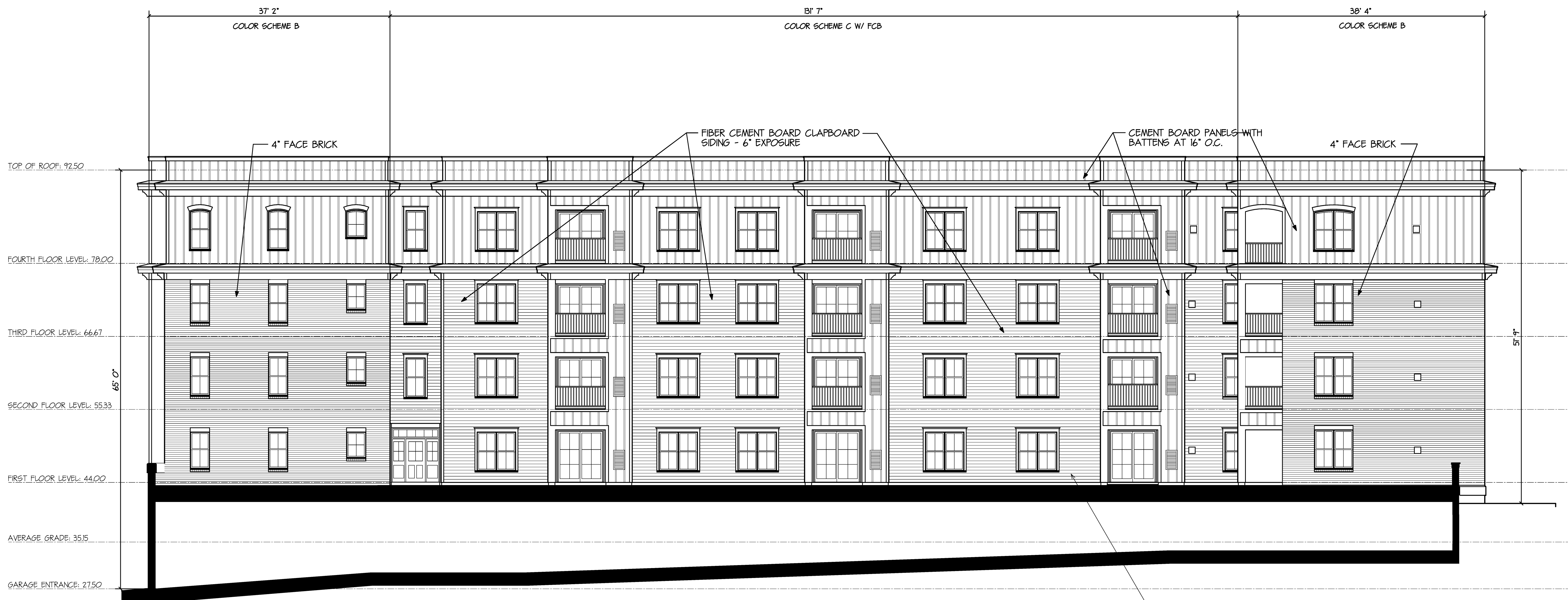
BUILDING 2 EAST COURTYARD ELEVATION SCALE: 1/16" = 1' 0"

CONTRACTOR TO NOTE THAT LOCATION OF CLAPBOARDS AT THE COURTYARD WILL VARY BASED ON THE GRADING AT THIS LEVEL. COORDINATE HEIGHT OF SIDING AND TRIM WITH THE FINAL COURTYARD LAYOUT AND WITH NOTES FOR MATERIALS ON THE SECTION SHEETS.