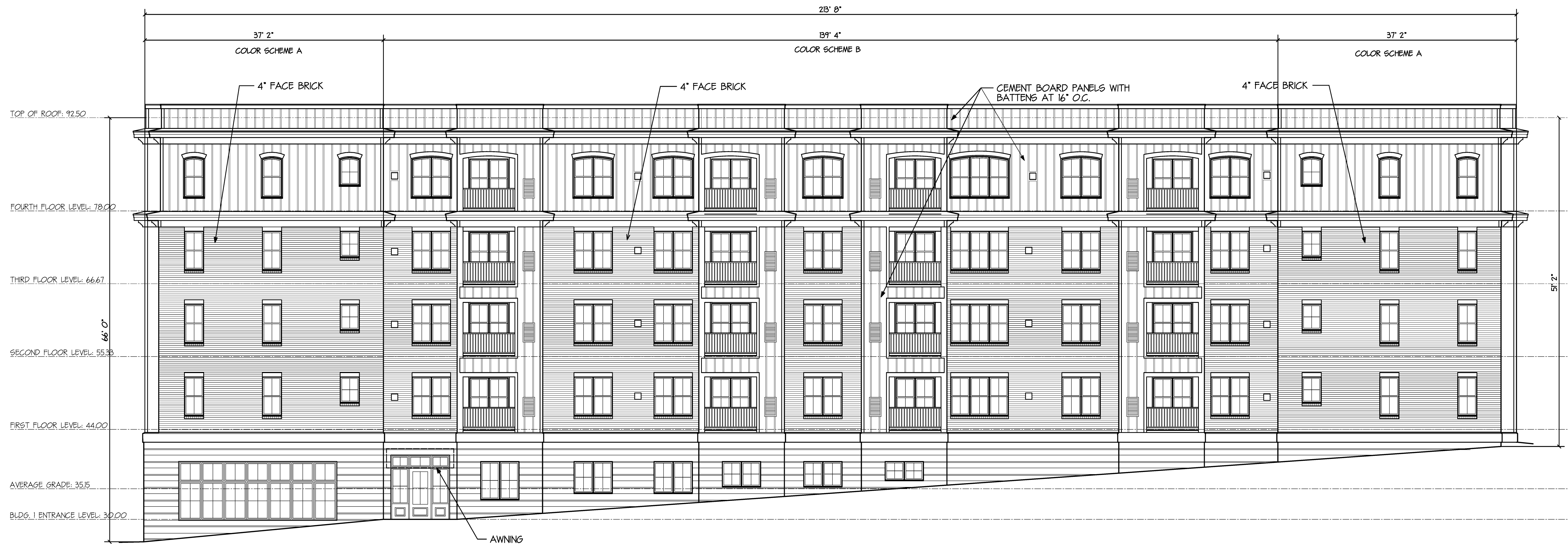
BUILDING 1 HANCOCK STREET ELEVATION