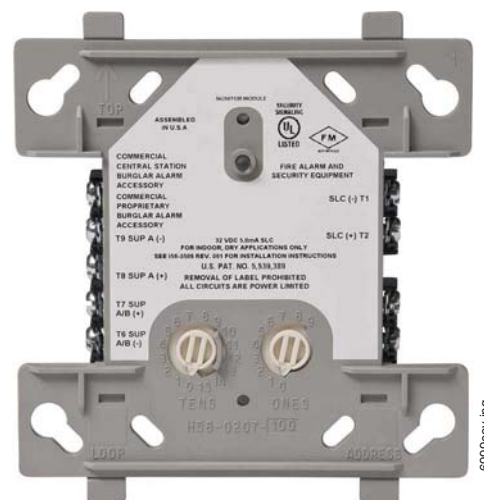
FMM-1(A) (Type H)

Use to monitor a zone of four-wire smoke detectors, manual fire alarm pull stations, waterflow devices, or other normally-open dry-contact alarm activation devices. May also be used to monitor normally-open supervisory devices with special supervisory indication at the control panel. Monitored circuit may be wired as an NFPA Style B (Class B) or Style D (Class