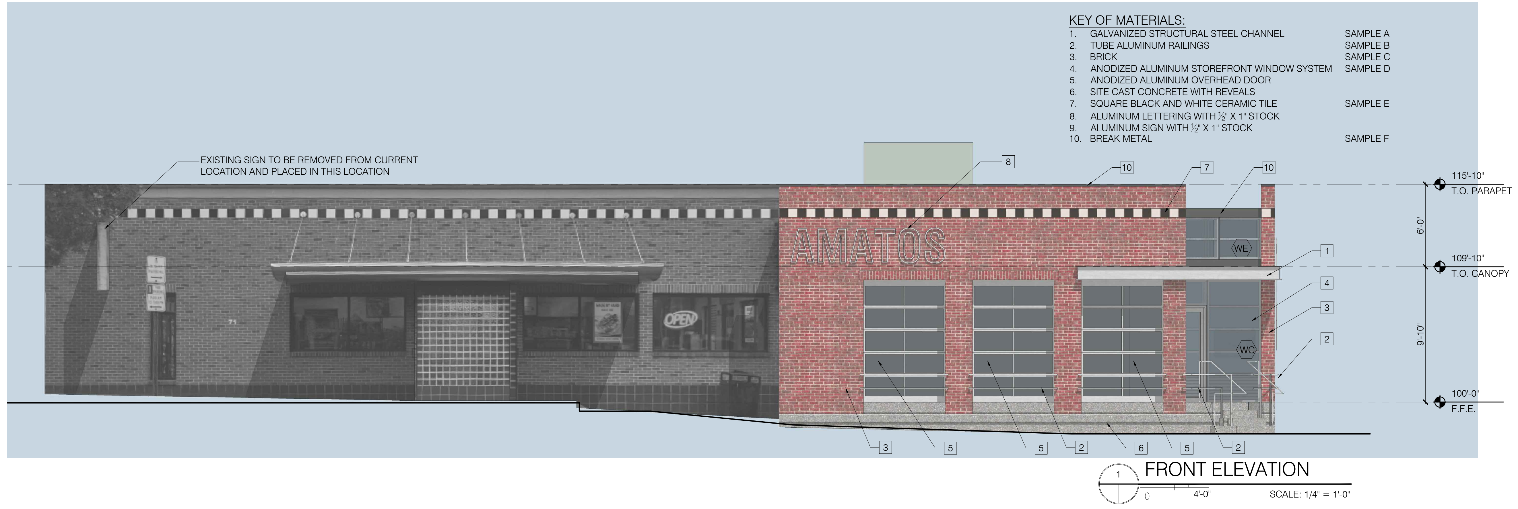
1 FRONT ELEVATION 0 4'-0" SCALE: 1/4" = 1'-0"