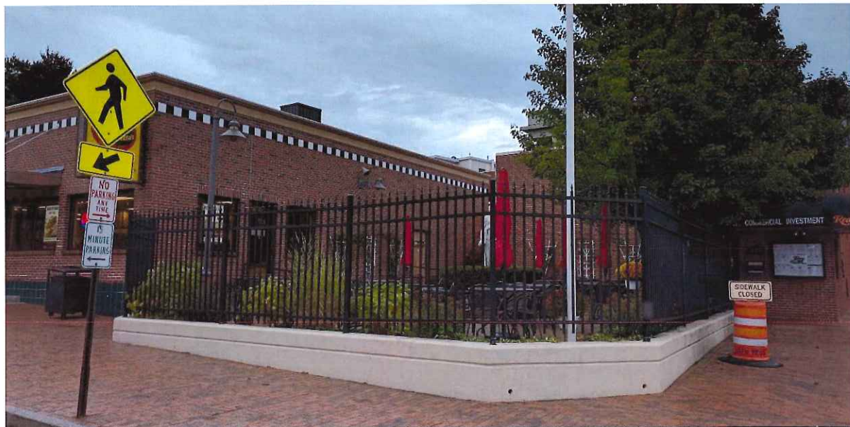
Close-up of existing foundation and dining garden.