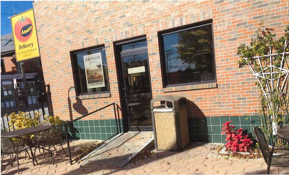
Location of opening from existing store to proposed dining room.