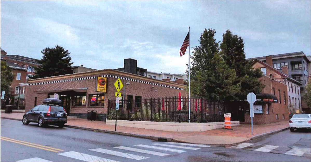
Street perspective of existing buildings and proposed site.