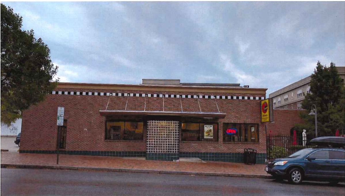
Front of existing Amatos Store.