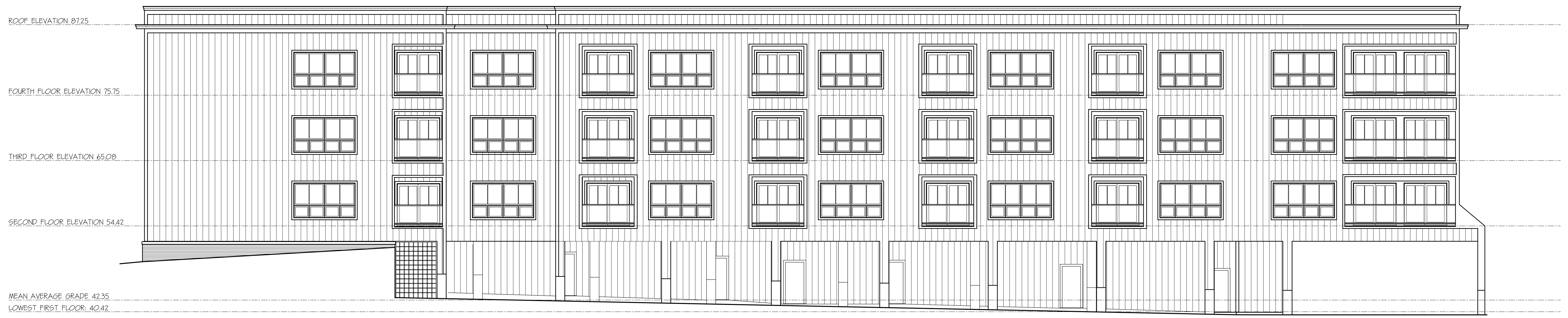
REAR ELEVATION SCALE: 1/8" = 1' 0"